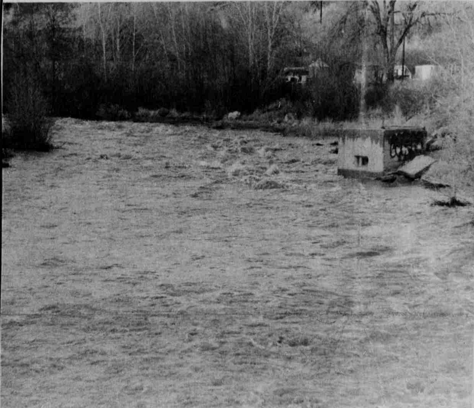
Roaring muddy waters caused by heavy rain that fell during the week. It polluted Shitike Creek and the surrounding area.