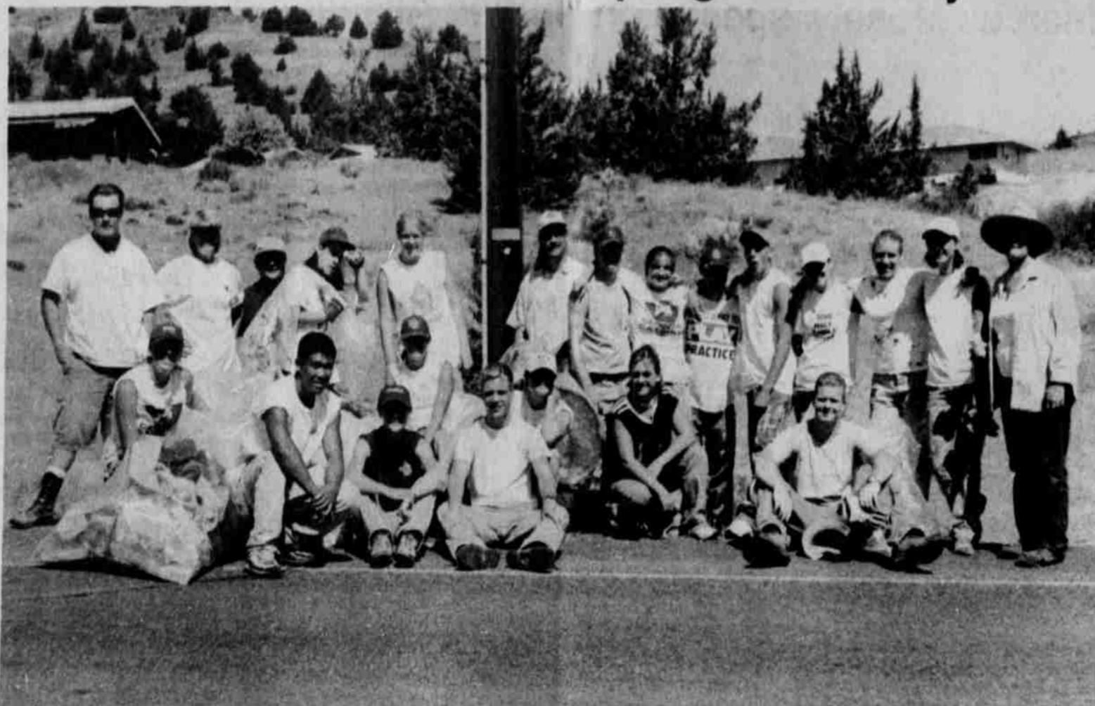
"Caravan 1999 to Warm Springs"

Caravan 99 took delight in their campout behind the Presbyterian Church. They were also treated to a rafting trip, rock climbing at Smith Rock State Park, swimming at Kah-Nee-Ta Resort and a tour of the Museum At Warm Springs. They held their closing ceremonies for end of their Caravan to Warm Springs Friday, August 2, 1999.