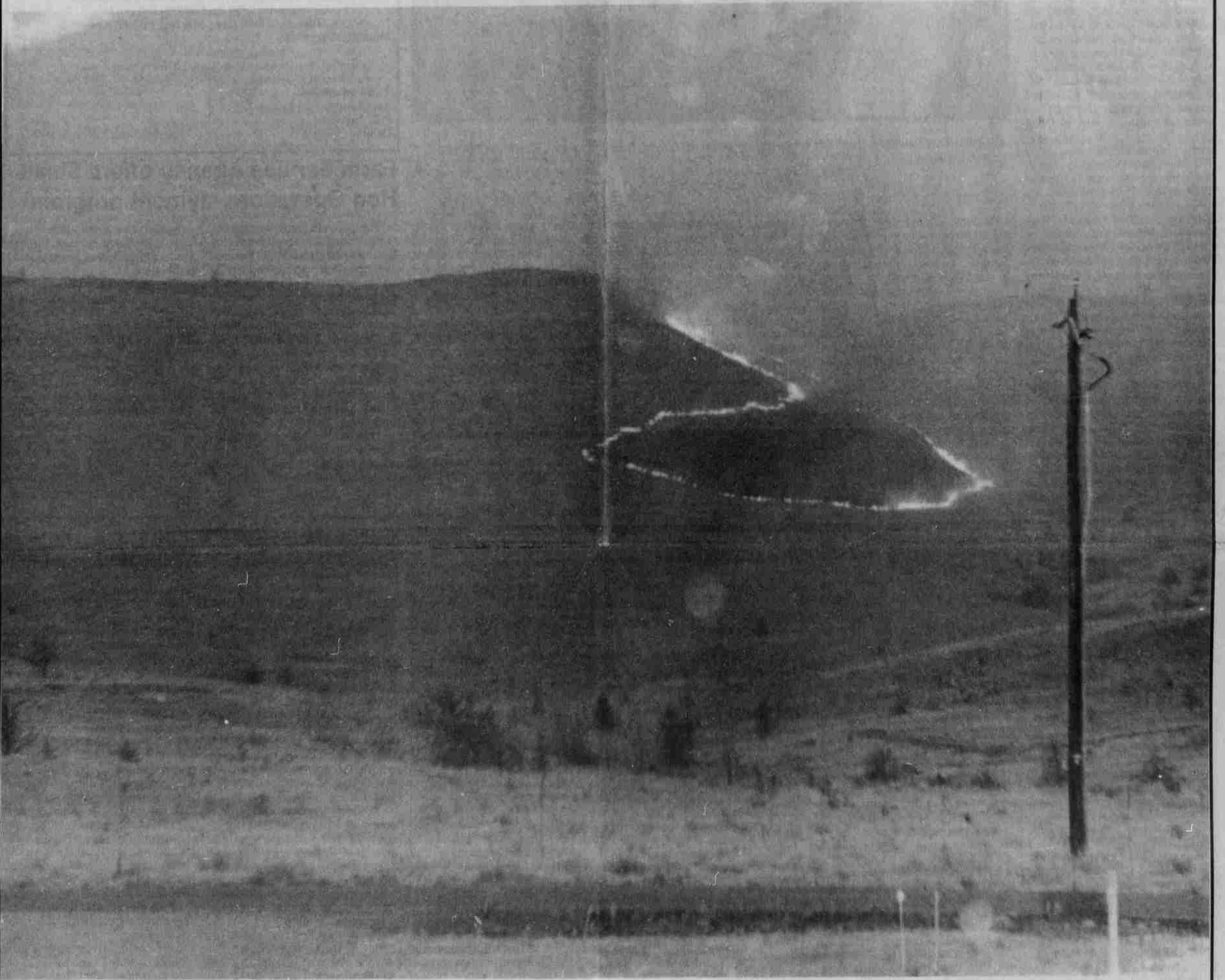
Heavy thunderstorms starting August 4, continued with very little rain through the week and have left over 1,000 reported down strikes on the Warm Springs reservation. The storms, mostly towards the evening hours has left over ninety fires confirmed. The fires were suppressed by Fire Management personnel. The largest fire reported during the thunderstorms, has been contained at 300 acres in size.