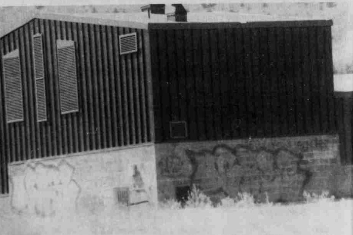
Vandals display their graffiti behind the Early Childhood Education building and kitchen area. Graffiti vandals have targeted other tribal buildings including vacant homes. In the past few months, vandals have included newly constructed homes as well as abandon or unoccupied houses. Abandon or parked vehicles have also been vandalized in the past few months.