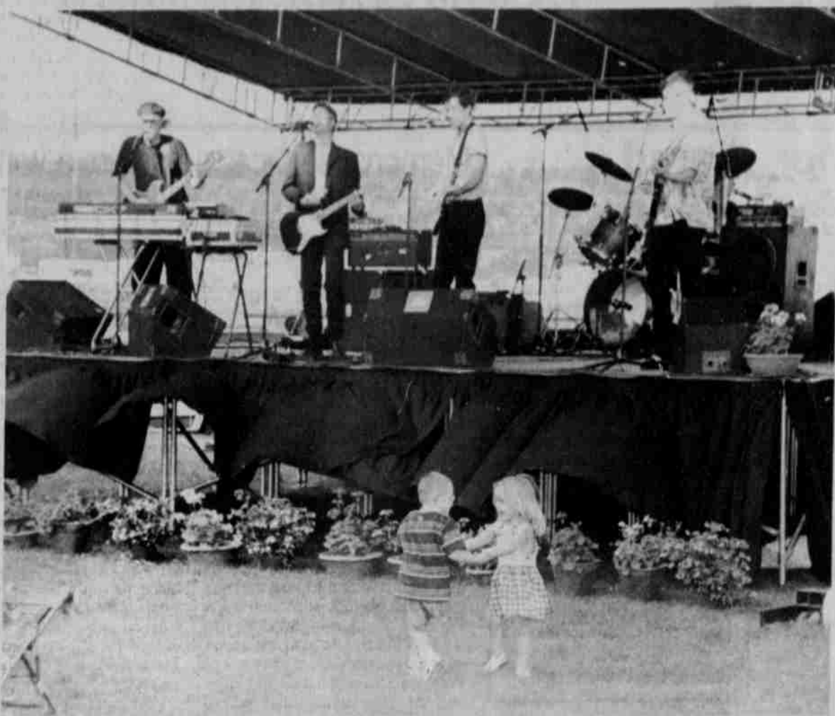
Louie, Louie, the Kingsman start things off on the main stag during the Jefferson County Fair