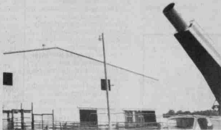
The human cannon was another exciting event at the fair