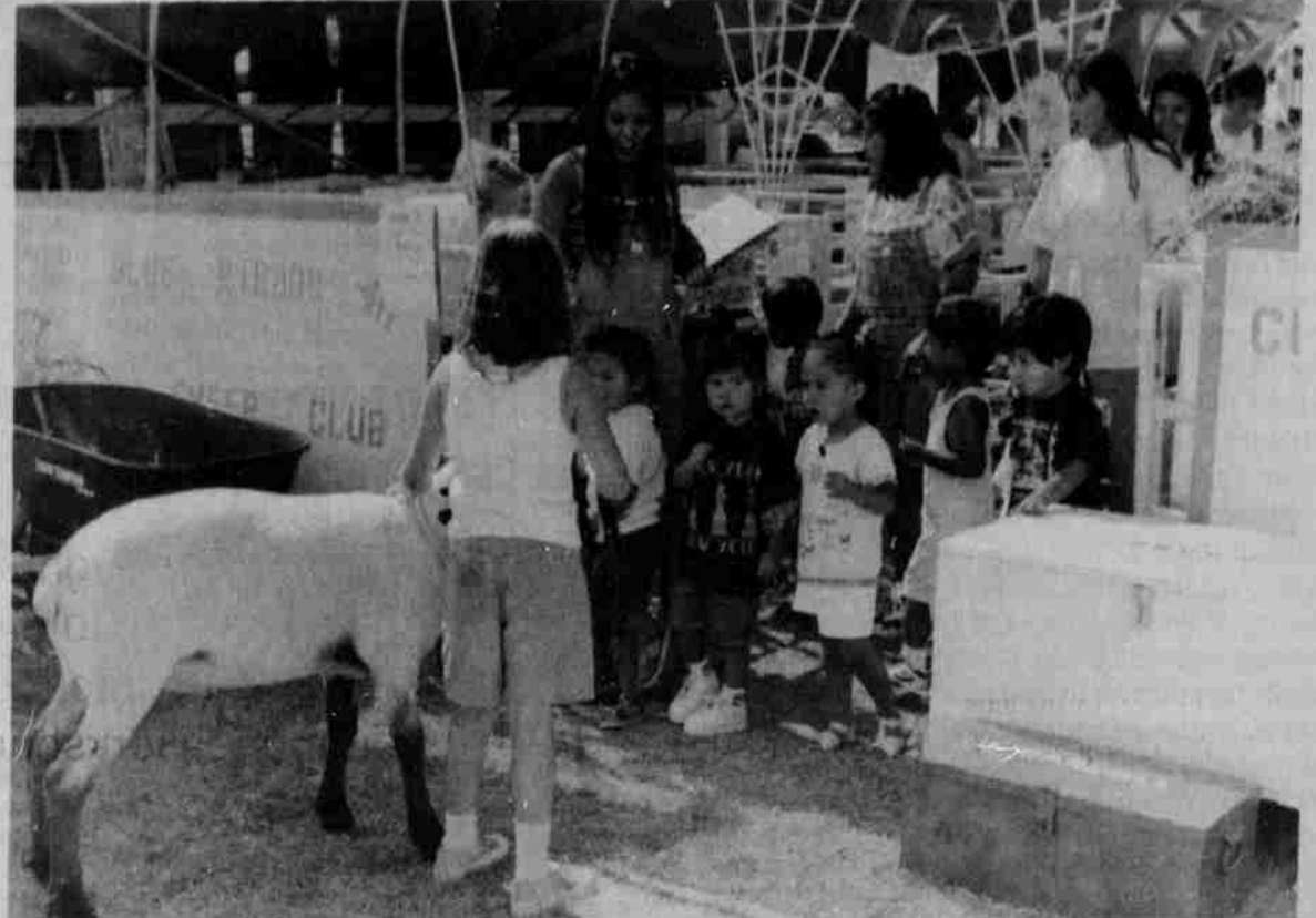
Children from the Head Start Program came to see the animals.