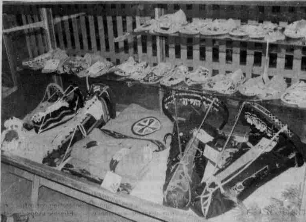
Native American crafts were judged and displayed at the fair.