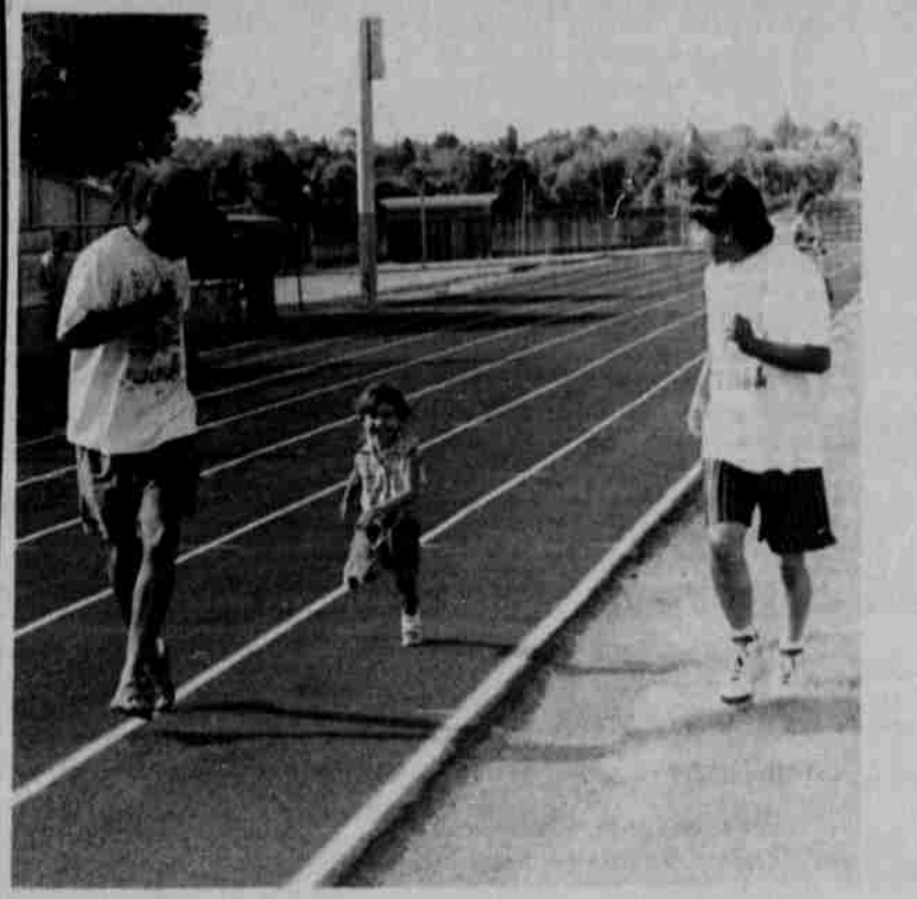
Little girl warms up with two of the parents that showed up to watch