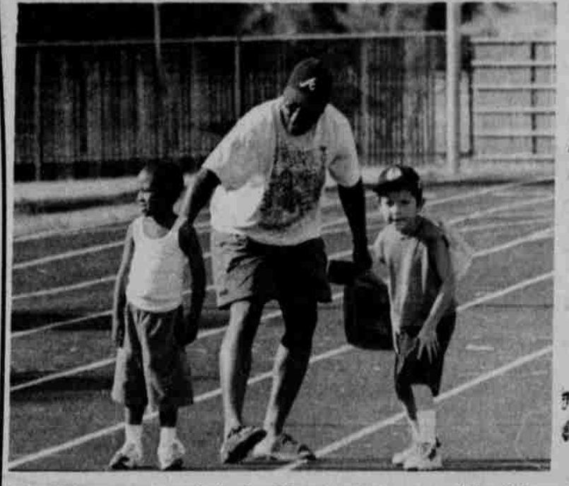
Two little guys get ready for the 50 meter dash as one of the kids dad looks on

One of the competitors in the 6-9 year old division throws the softball in the softball throw