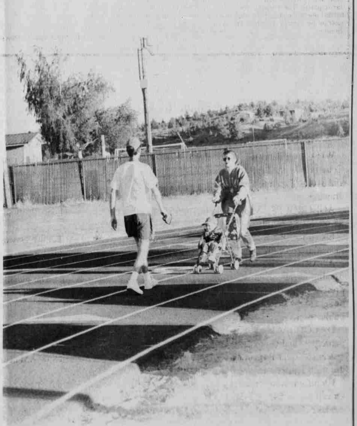
This man walked backwards to enjoy the company of a lady and her kid that followed close behind him