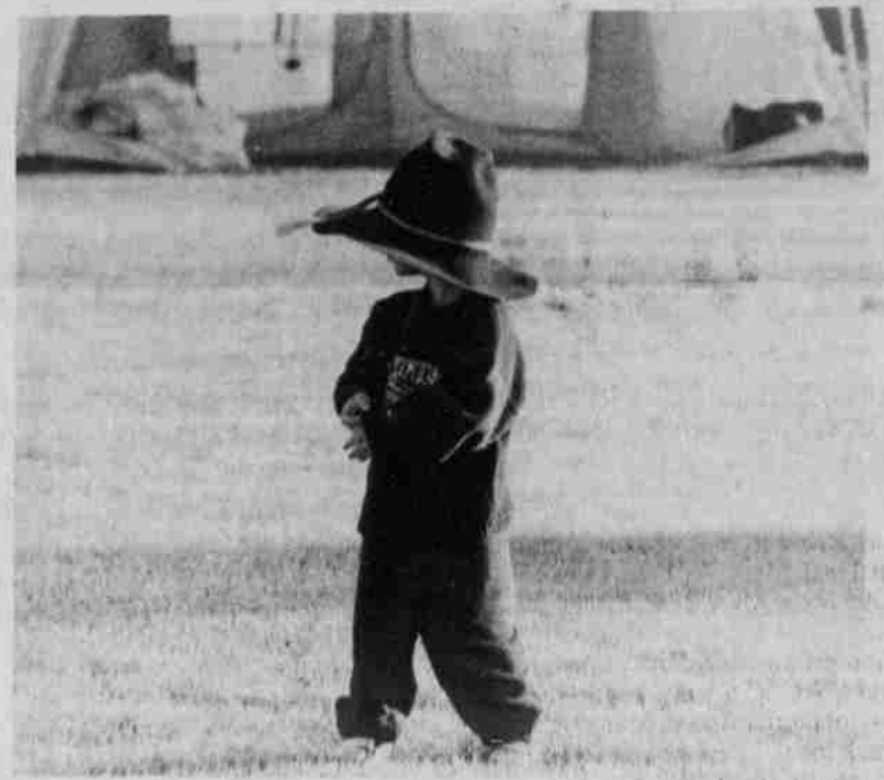
Relay for Life was for everyone including this little cowboy