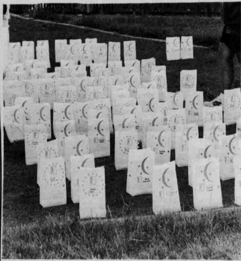
Shown above are the luminaries that participants put around the track for victims of cancer that they know

This year the event once again had many teams that raised over $23,000 for the fight against cancer. The Relay for Life organizers are thankful for all the participants that took the time to help make this event possible and hope that everyone had a good time.