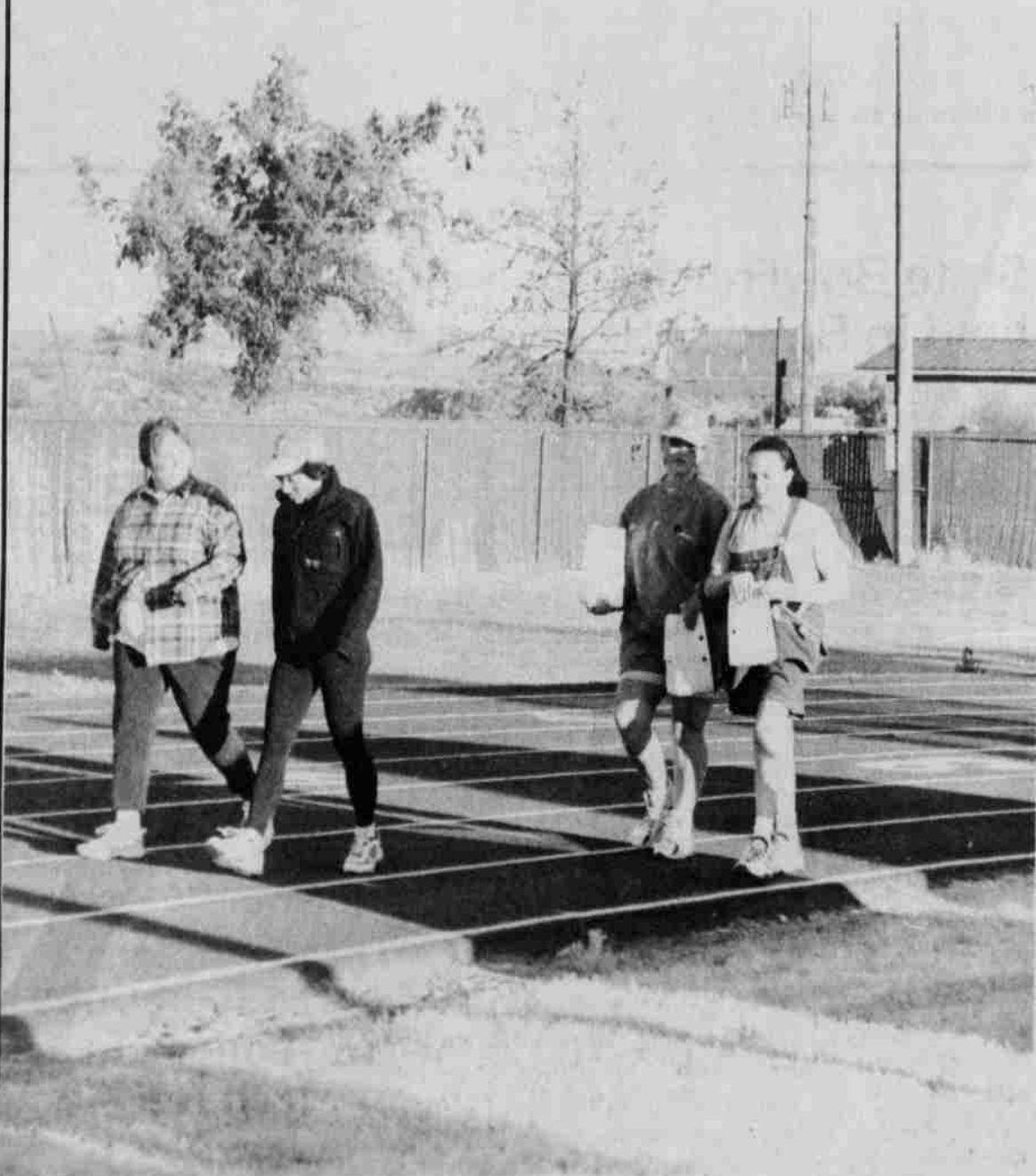
People walked and talked with others during the 24-hour fight for cancer