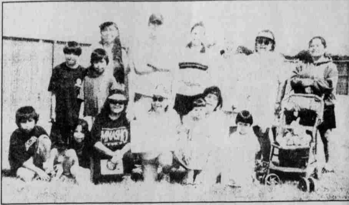
Pictured above are the Honey Bears who were one of many teams to participate in the Relay for Life