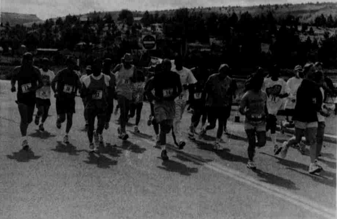
Runners from near and far gathered early in the morning to run in the Roadwarrior's Pi-Ume-Sha run

The Roadwarrior's Pi-Ume-Sha Run was held on Saturday June 26, 1999. The run had three different distances which were the 5k, 10k, and 10k walk.