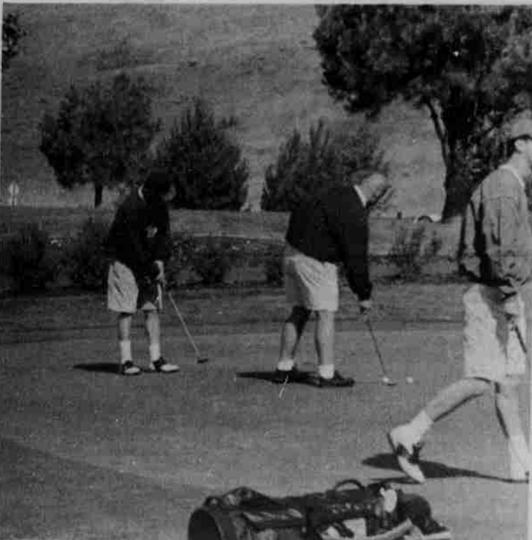
People getting warmed up at the putting range before the tourney

The Fry Bread Open Golf Tournament was held on June 26, 1999 at the Kah-Nee-Ta Golf Resort.