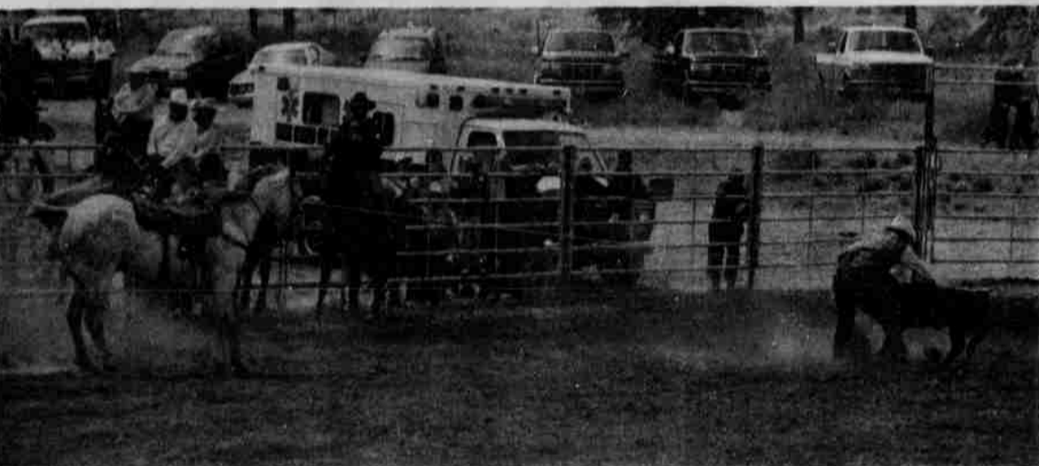
The cowboy on the horse has just roped the calf so the other cowboy can tie the calf up like a hog