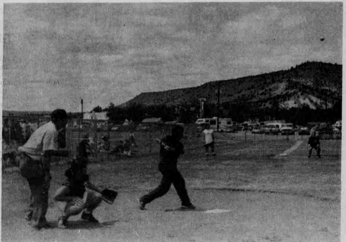
A lady hits a pop fly as the catcher and third baseman look on