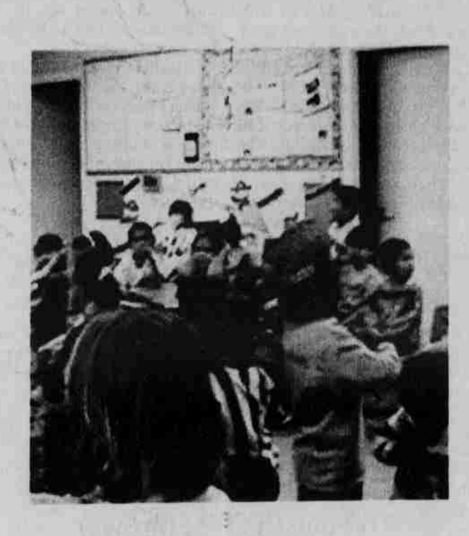
PINAPŁKWI WIYANAWITPAMÁ WIWANICHT SENTENCES FOR THE BIRTHDAY LESSON

Páxat iwá ilagaaixitpamá. There are five candles.