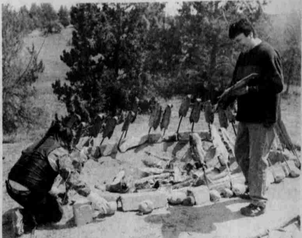
Fresh Salmon roasting on an open pit for the meal during the honor Seniors day here in Warm Springs, on May 14, 1999.