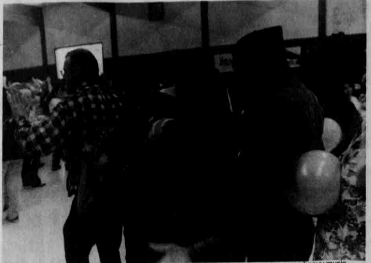
All the participants had to keep a balloon between them as they danced around to some heavy music, everyone enjoyed them selves during the day.