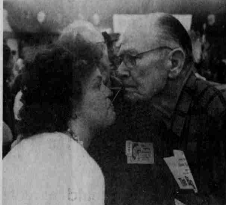
All participants had to pass a lifesaver candy from one tooth pick to the other without using their hands.