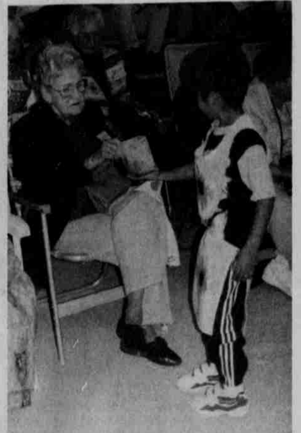
The little kids had their own give away during the honor sinors day, here a little boy is giving away a gift.