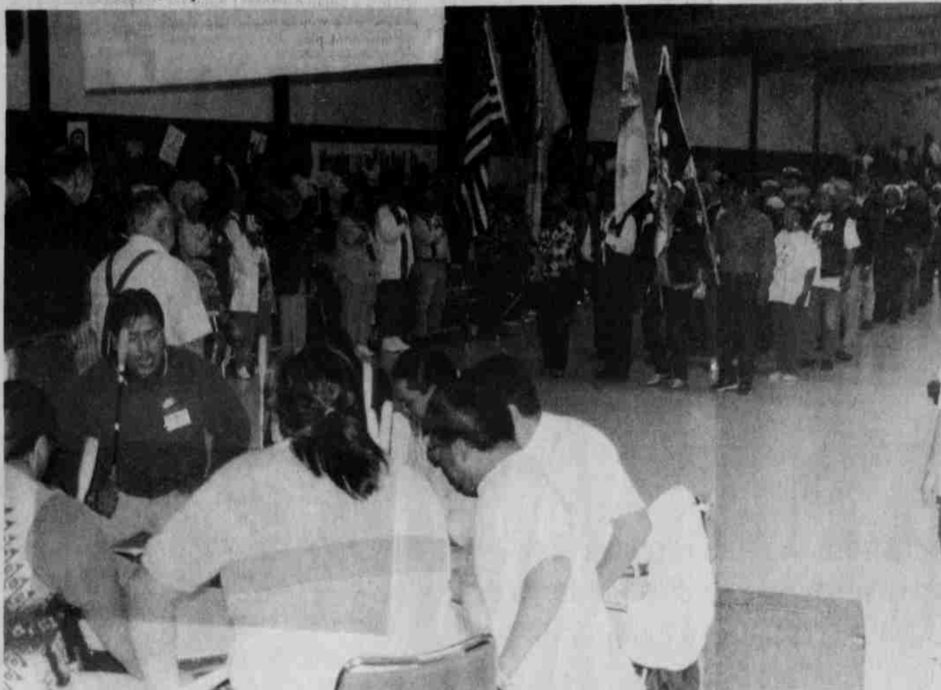
The Posting of the colors was done by the local veterans at the Honor the Seniors day in the longhouse here in Warm Springs. It was a great day.