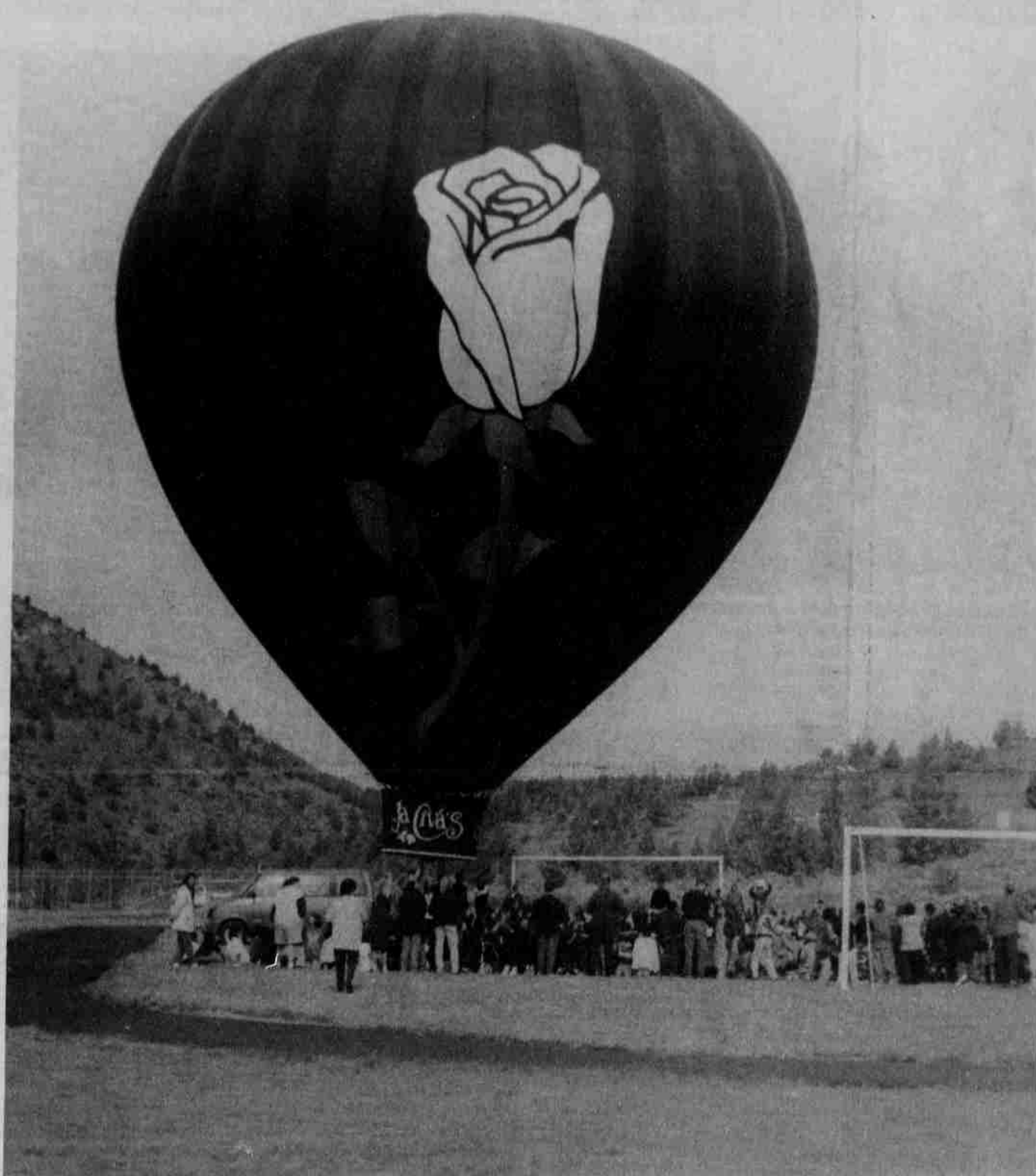
Warm Springs Elementary School students gather to see the balloon inflated and ready to ride.