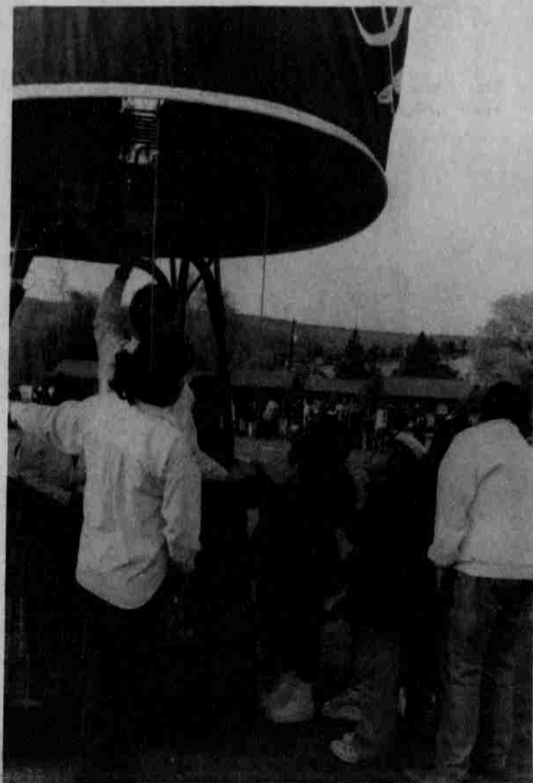
All the students were allowed to look inside the balloon.