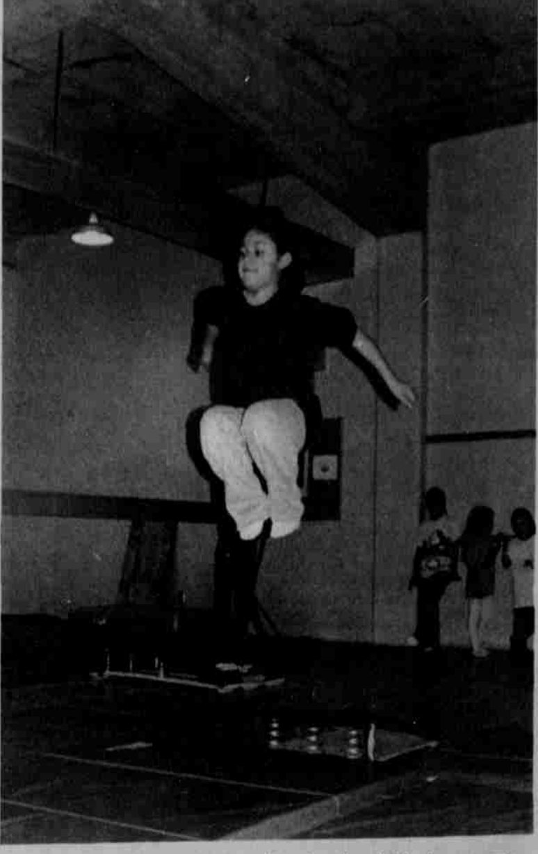
Young girl leaps off a spring board to show how high she can get