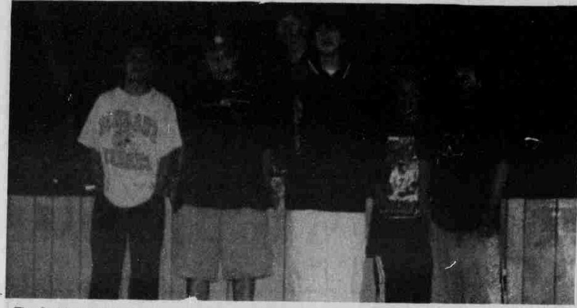
The Stable team that went to Pendelton and competed in the B.A..A.D. tournament

Kah-Nee-Ta Stable basketball team traveled to Pendelton, Oregon to participate in the BAAD basketball tournament. In order for the boys to travel they