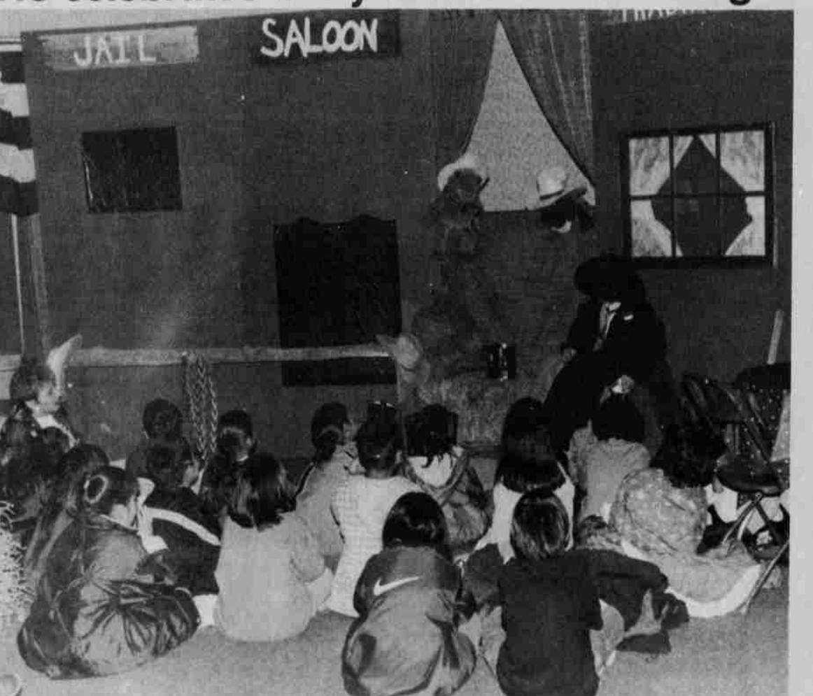
Warm Springs Elementary School kids enjoy a puppet show at IHS during their five year building celebration.

On February 3, from 9 a.m. to 12 p.m., the community was invited by Indian Health Services of Warm Springs, to attend their open house celebrating five years of service at the current location. The open house included a 1/2 presentation comparing services and the facility from before 1993 to the current facility and it's services. A puppet show for the kids was provided by the Dental department along with a mini health