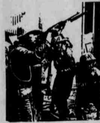
Tips on obtaining VA Benefits:

Always obtain assistance from The American Legion to help you present your claim for VA benefits. This help is free. Do not wait until a disability really bothers you to file a claim for service-connected compensation. It is important to establish service connection for condition as early as possible. When you first apply for benefits, VA assigns a unique claim number (C-number) to your claim so that it can be easily identified. The Claim number is usually your Social Security number. Be sure you or your advocate put your C-number on any letter or document you send to VA.