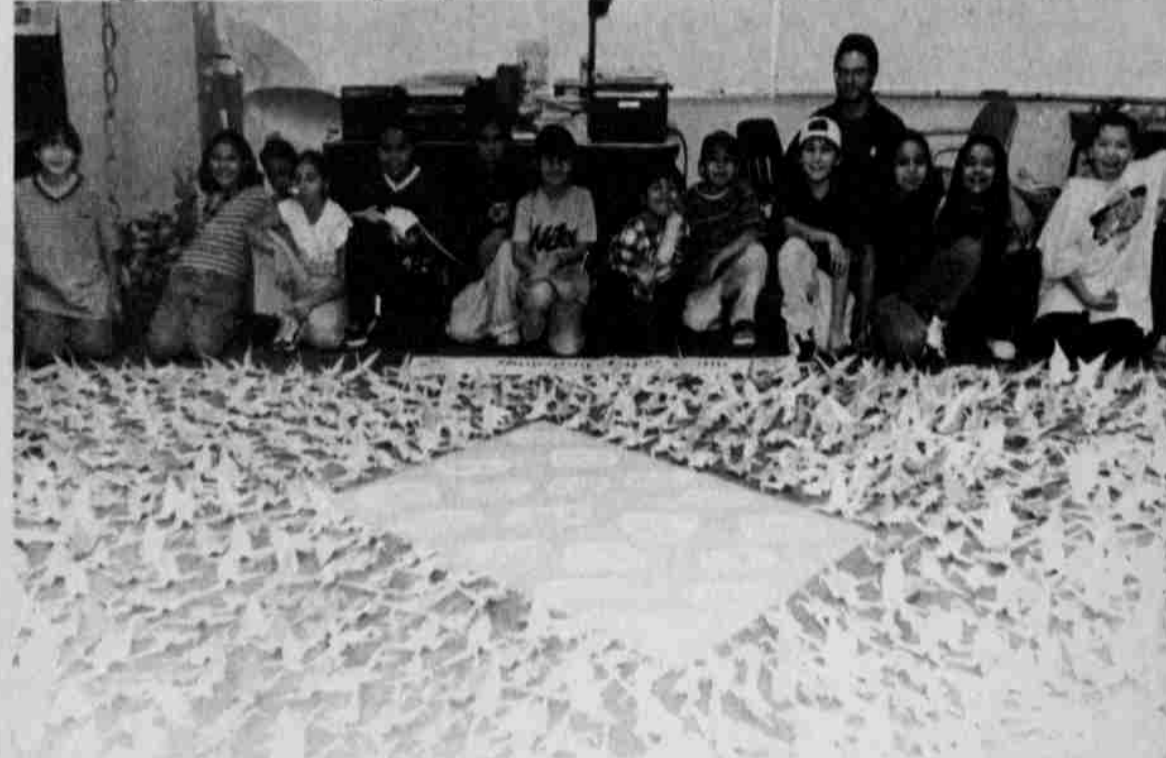
Room 25, fourth grade teacher and students pose with their paper crane display. The paper crane display can also be seen with the childrens art display, at The Museum at Warm Springs.