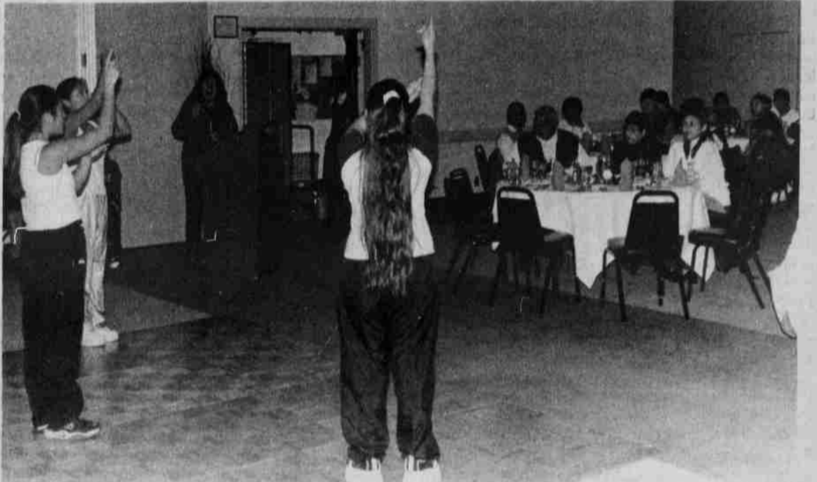
Entertainment was provided by Native Expressions of Warm Springs