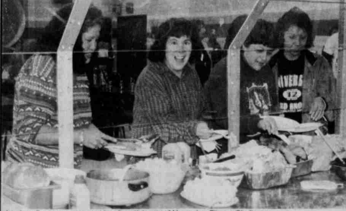
A turkey dinner was prepared for all participants of November Fitness Challenge