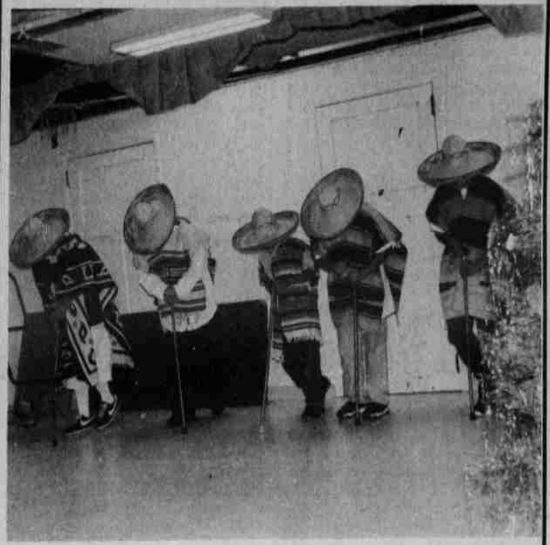
The Hispanic dancers entertained in the social hall.