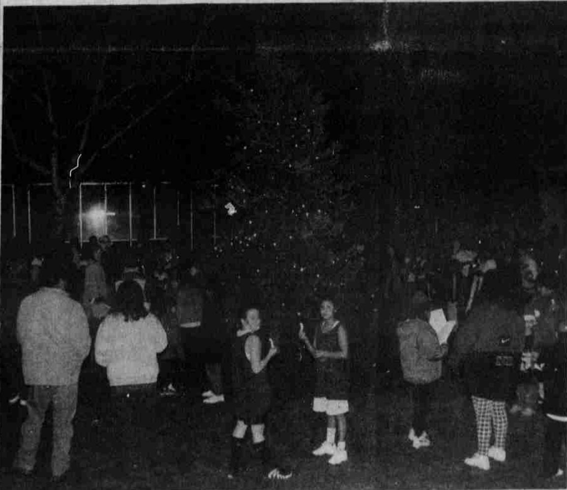
Lighting of the tree was beautiful.