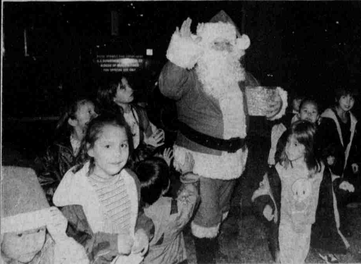
Santa's entrance gathered children of all ages.