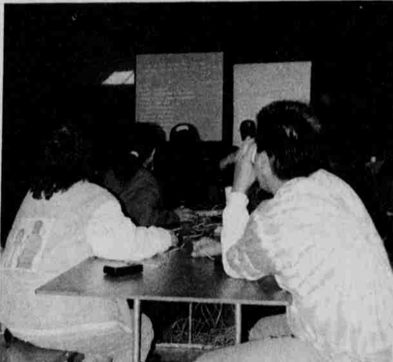
Electronic voting was enjoyed by those who attended the Comprehensive Plan community conference on November 9. Results from the conference will be in the next edition of the Spilyay Tymoo.

If you want to donate some stuff animals, to Fire & Safety, you can take your donation to either the Simnasho or Agency fire halls.