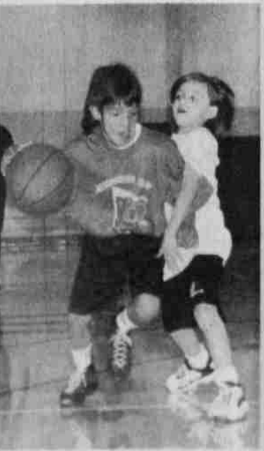
Runnin Rebels play their defense.