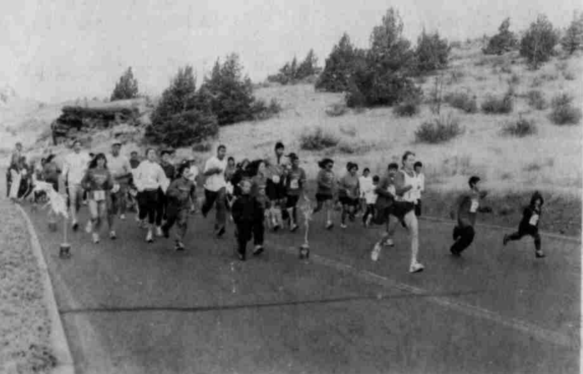
A total of 58 runners compete in 1998 Fall Run.

The Kah-Nee-Ta Fall Run is sponsored and supported by the Warm Springs Community Wellness/Recreation Department. The Fall Run draws runners and walkers from the Central Oregon communities. The Recreation staff appreciates the parents who actively participate with their children in the Community Wellness/Recreation activities and events.