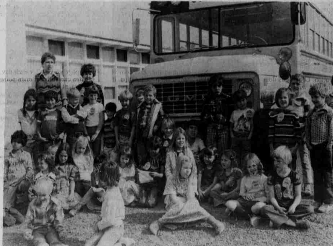
Class visitation at Simnasho School