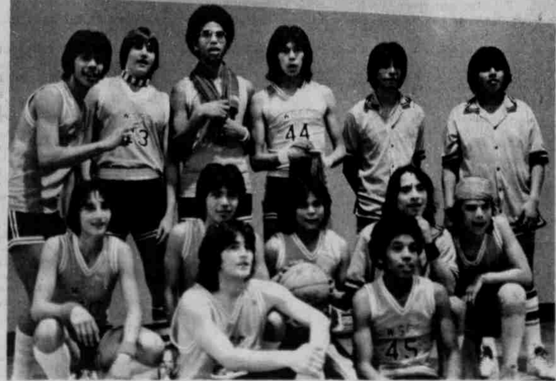
The Mod Squad