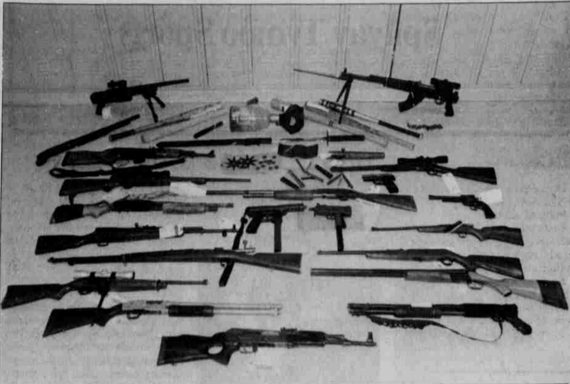
Weapons confiscated by the Warm Springs Police within the last six months.