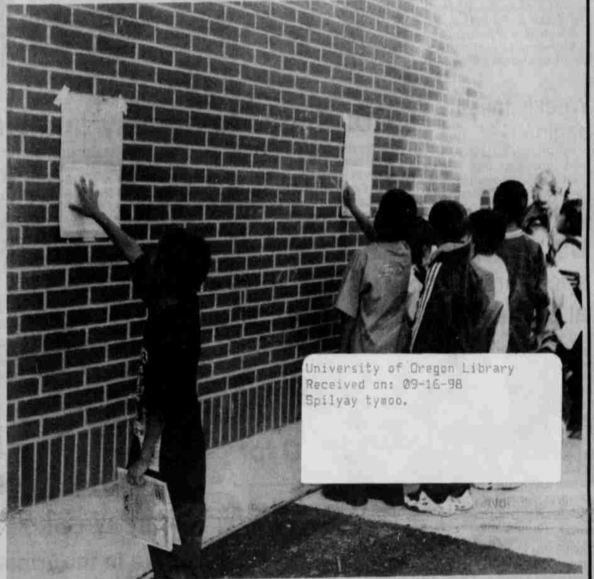
Students checked for their names on the classroom lists.

Use caution while driving near the school and when you see a school bus in the community. For the safety of all children.