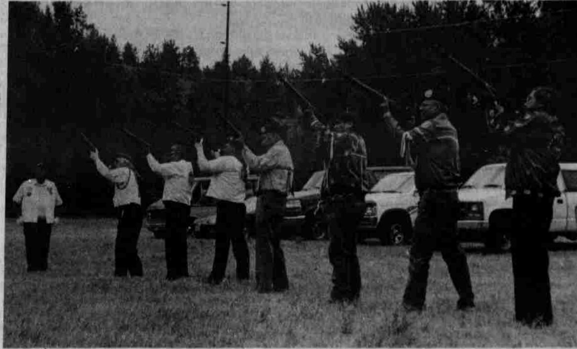
The Rifle Ceremony was performed by Veterans from Yakama Nation and Warm Springs.

for lunch which was prepared by the Ladies Auxiliary.