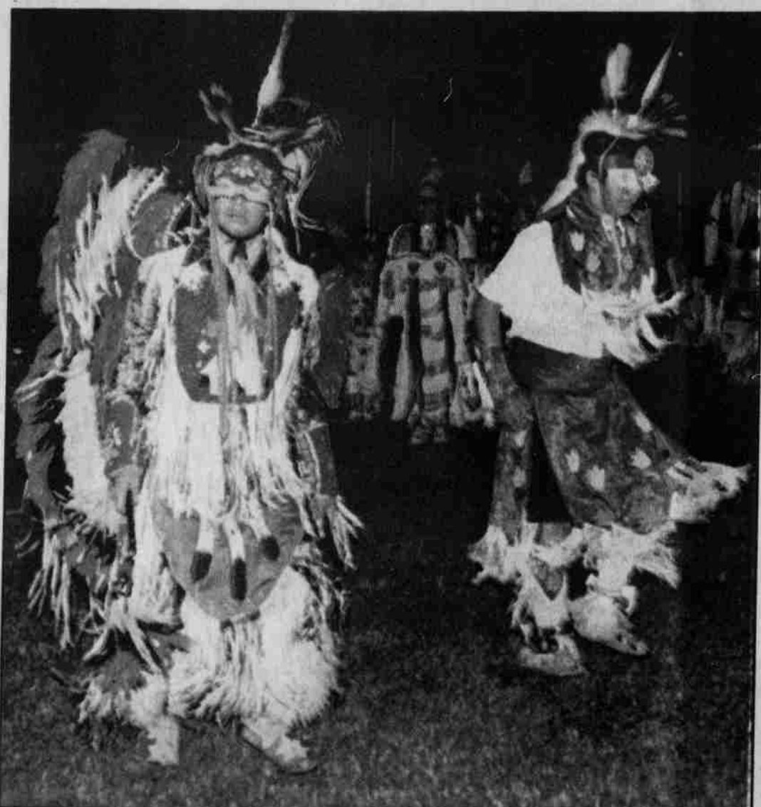
Fancy dancers make their way around arena during grand entry.