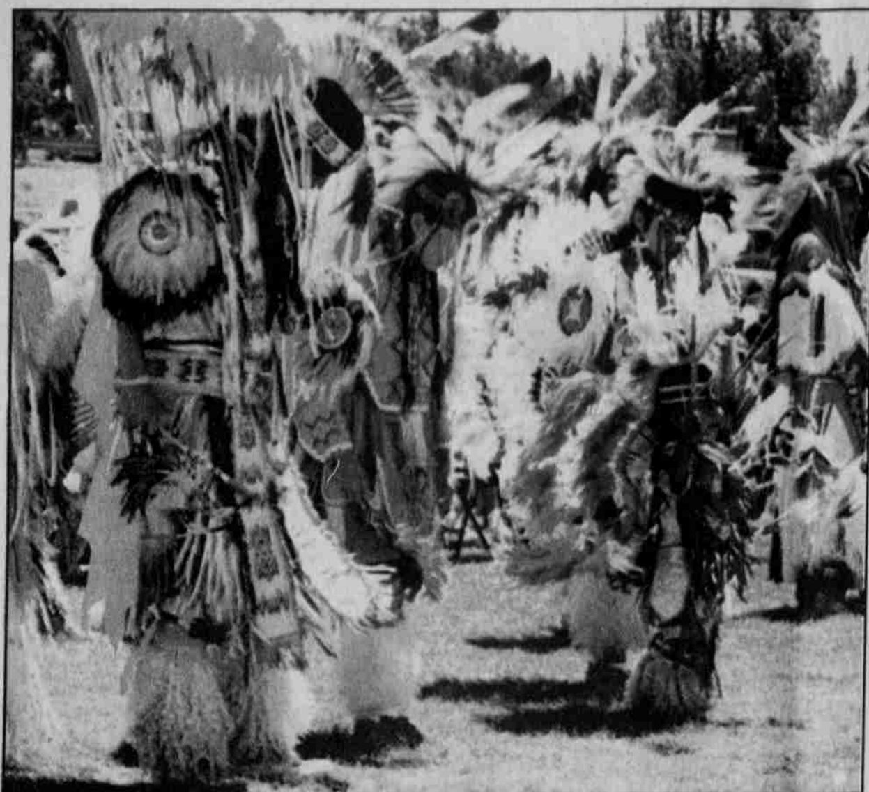
A young fancy dancer appears to really enjoy grand entry.