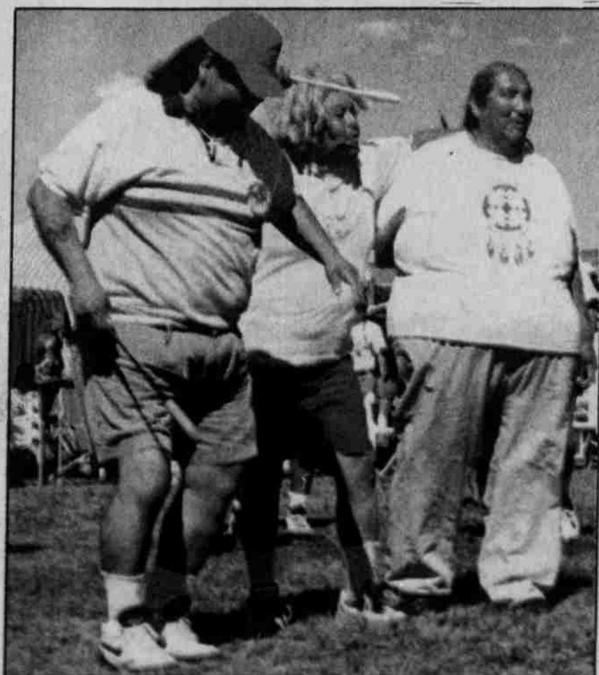
Pi-Ume-Sha is unofficial home of the "Fluffy Dance".