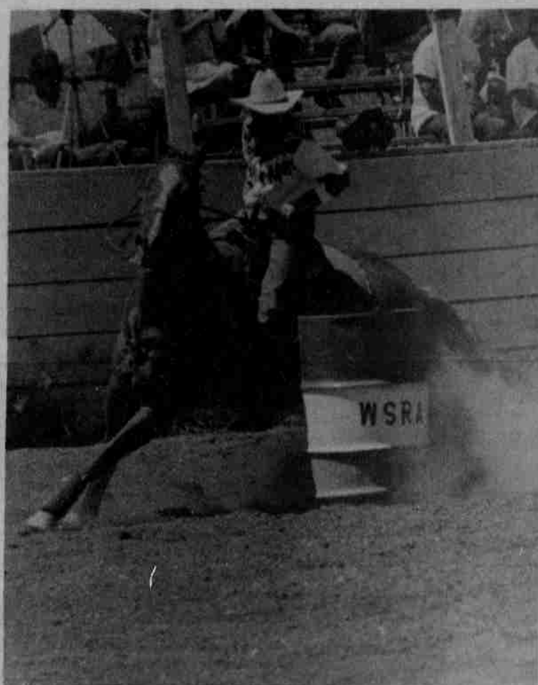
Ladies Barrel Racing was a big success.