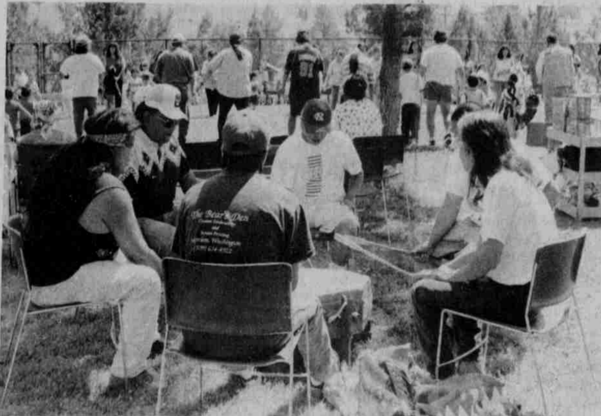
Drummers helped ECE students, parents and staff celebrate youth during powwow earlier this month.