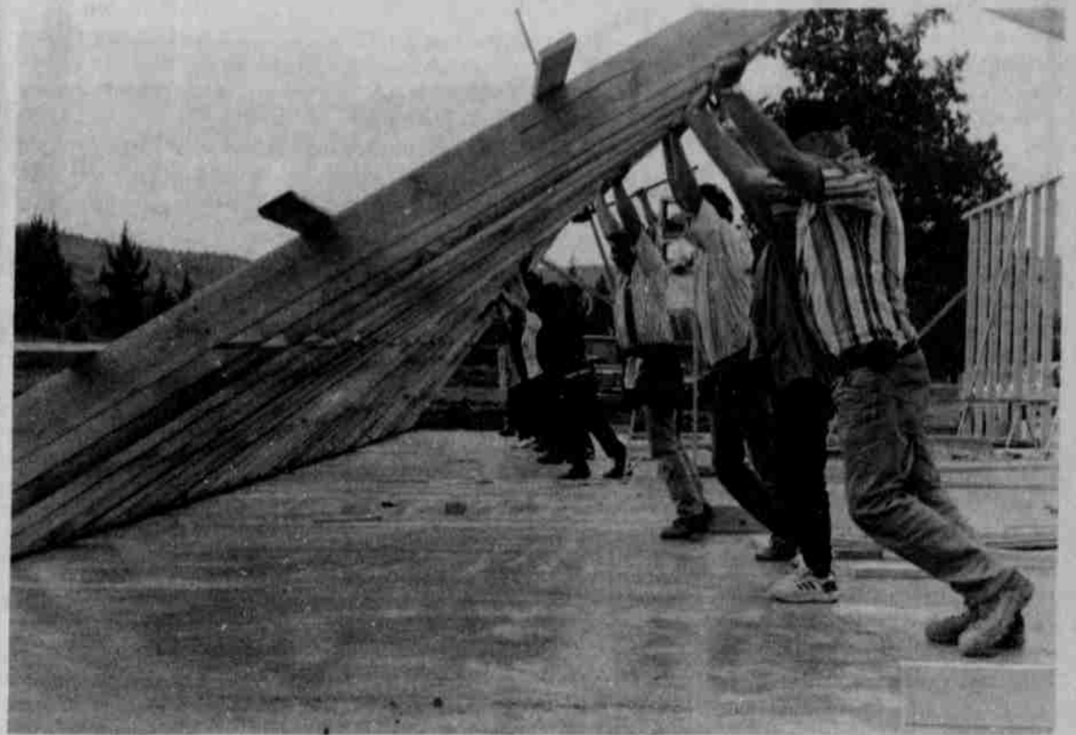
The heaviest wall was put in place by volunteers who were present.