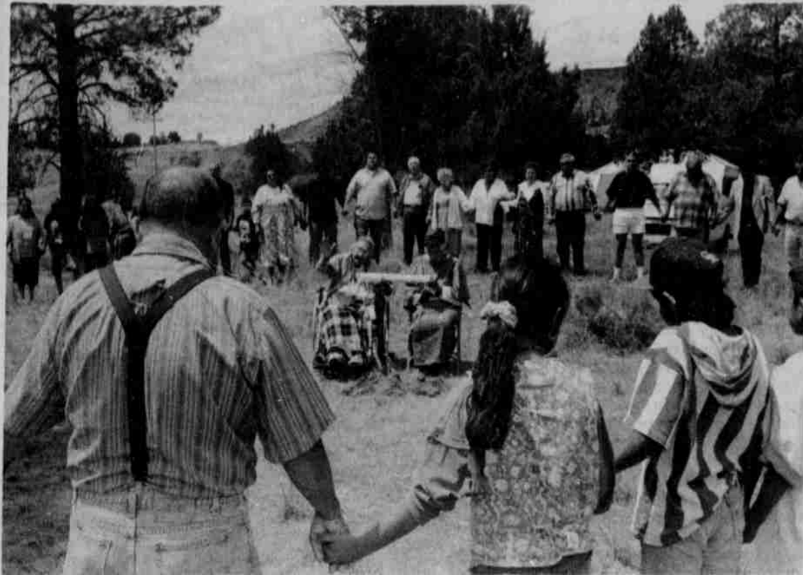
Groundbreaking ceremonies were held in June 1994 to begin construction.