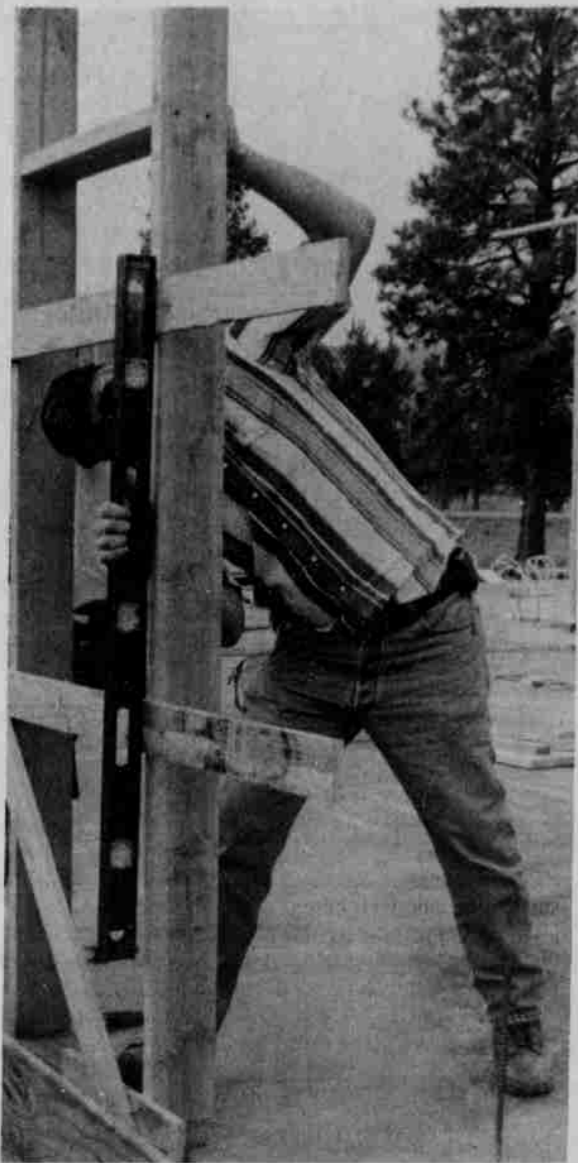
Walls were leveled when put into place.

The Full Gospel Church was condemned and partially torn down and plans were drawn for the new church in 1994. Groundbreaking ceremonies were held. Construction was stopped completely until recently when the Tribes established a grant for a new church building. Construction will continue and they will go as far as they can until funds run out. Church members hold Indian taco sales every Thursday and Friday to raise money to continue construction.