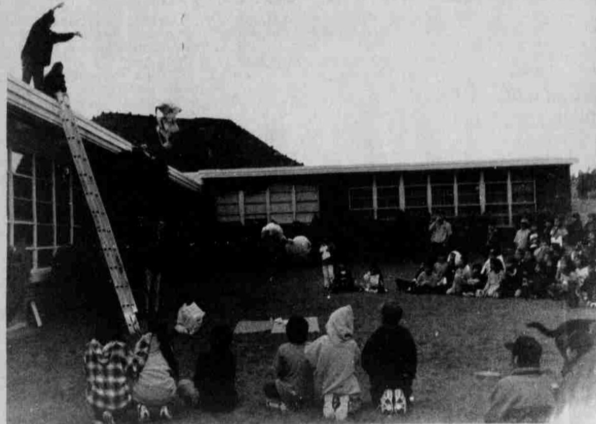
Third and Fourth grade students wait and see if their egg will survive the egg drop. Dawn Smith drops the eggs from the rooftop of the school.

dinner, plus conference materials. Deadline for pre-registration is May 1, 1998. On-Site registration $105.00 and daily registration is $35.00. Elders and students: Early registration is $50.00 and on-site is $65.00. Daily registration is $35.00. For registration information and packet contact: Minnie Yahtin, PO Box C, Warm Springs, OR 97761; (541) 553-3257 (work).