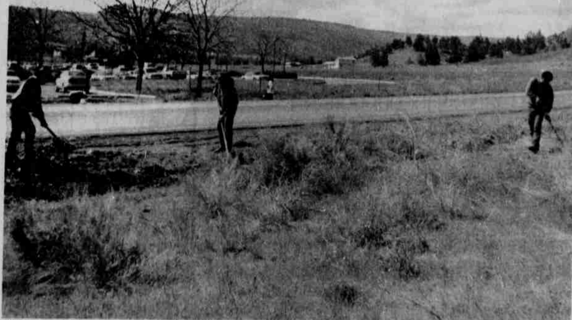
After completing clean up in the West Hills area, WEDD crew continue to clean up around the Administration entrance and Tenino road area.

(submitted by the WEDD team) The WEDD department (Work Experience Development Department) has another exciting project under way. WEDD has hired two crews and two foremen to complete a "Community Beautification Project." The intent of the new project: • Provide temporary work development/enhancement to complete a worthy project • Clean up and enhance the community • Create a "welcome to Warm Springs" area • Plant trees, shrubs, and flowers in the community • Provide yard services for community elders (grass cutting, tree trimming, fence repair, flower or