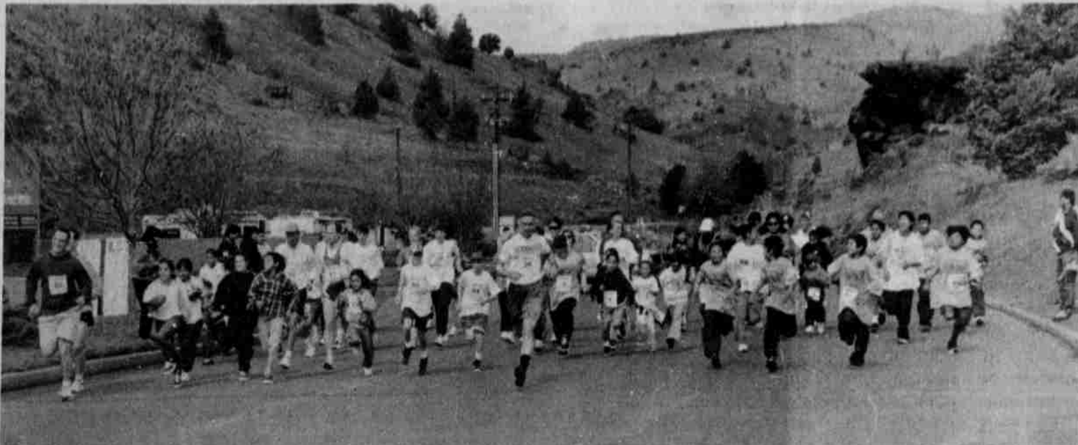
55 runners at the starting line for 3.0 mile, 1.0 mile and 10K events.