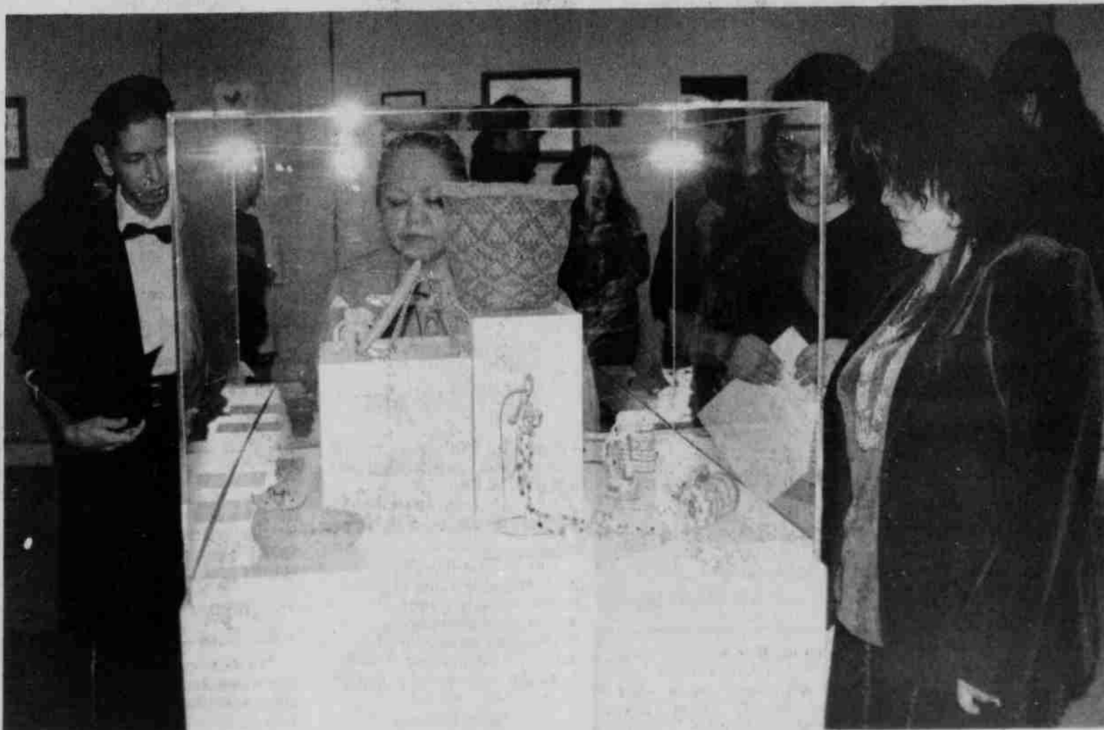
Many community members were in attendance of the opening night.