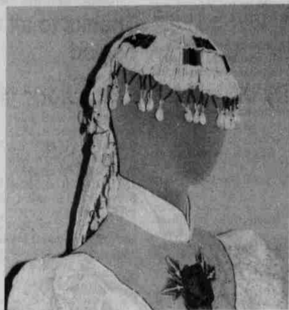
Wasco Wedding Veil, by Bridgette Scott-Whipple.