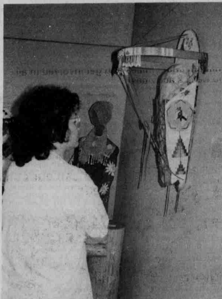
Fully Beaded Baby Board by Bridgette Scott-Whipple.