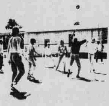
Budget and recreational activities

This is a long-term specialized program for veterans age 55 and over who are seeking treatment for problems of alcohol or drug abuse. The 'Class of 45' Groups are held during the day.