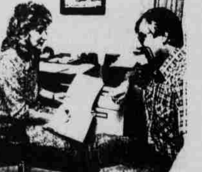
Individualized treatment planning

Narcotics Anonymous Portland Hotline: (503) 233-2235 Vancouver Hotline (206) 573-3063 Cocaine Anonymous Portland: (503) 256-1666 Portland Alanon: (503) 292-1333 Vancouver Alanon: (206) 693-5781