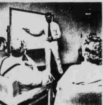
Speaking about yourself and others