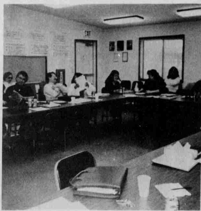
Comprehensive Planning Team enjoy a Team-building session in preparation for February & March community meetings.

The departments are also having a raffle, tickets are $1.00 each or six for $5.00.