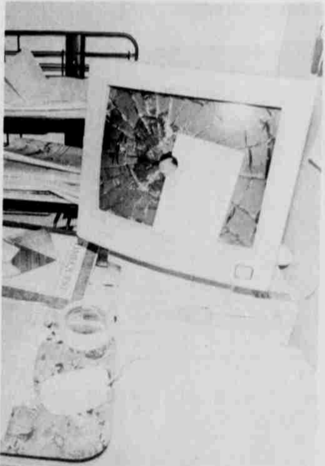
Vandals did thousands of dollars in damage to Language Program computers and related equipment.