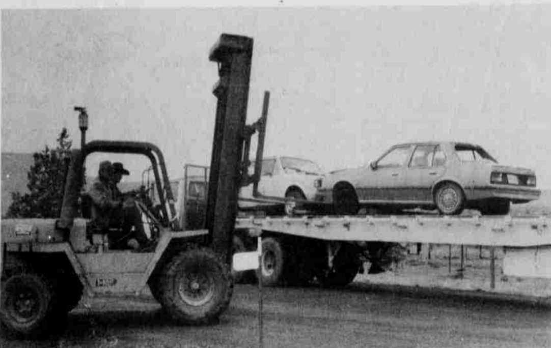
For the second consecutive year, disabled cars were crushed and hauled away.