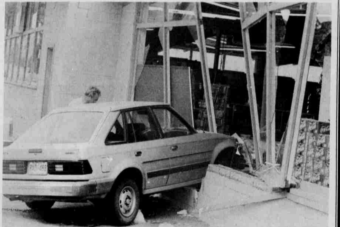
Warm Springs Market almost became a drive-through.