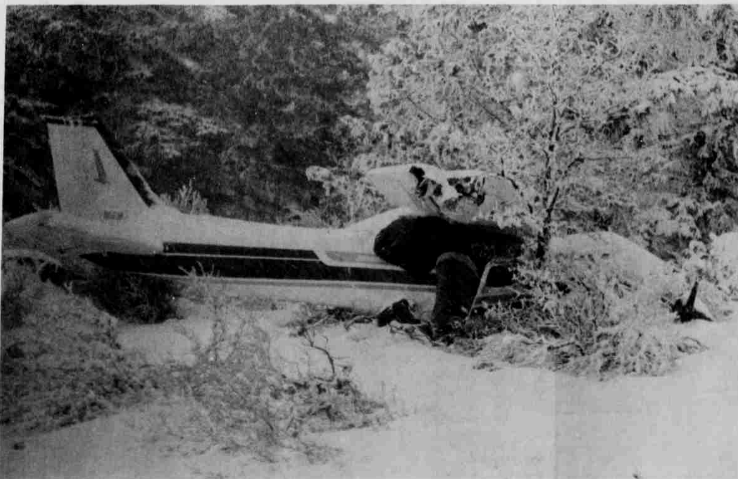
A pilot narrowly escaped serious injury in a mid-winter plane crash.