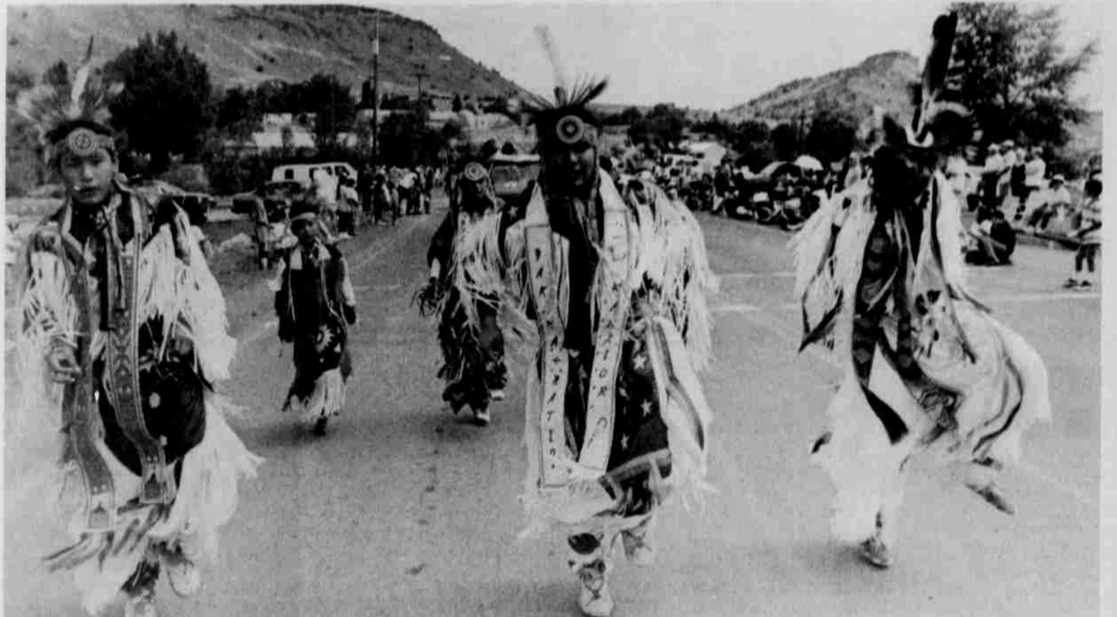
Dancers participated in Pi-Urme-Sha parade.