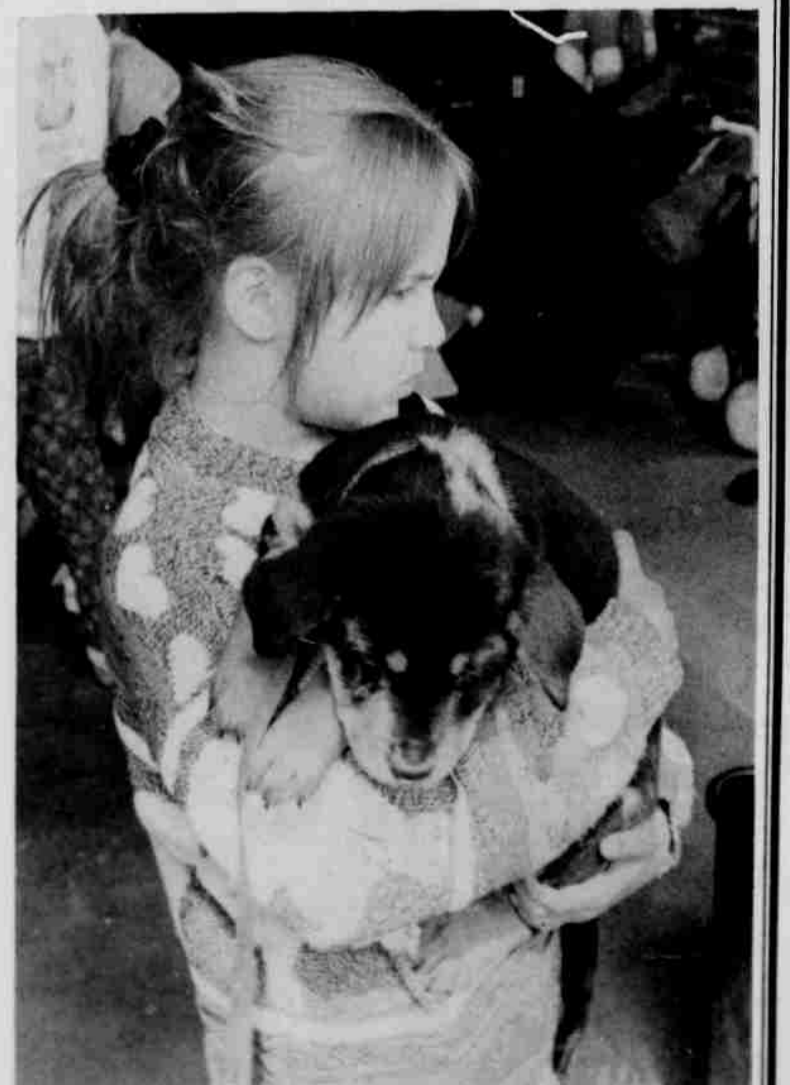
Local dog owners participated in licensing program.