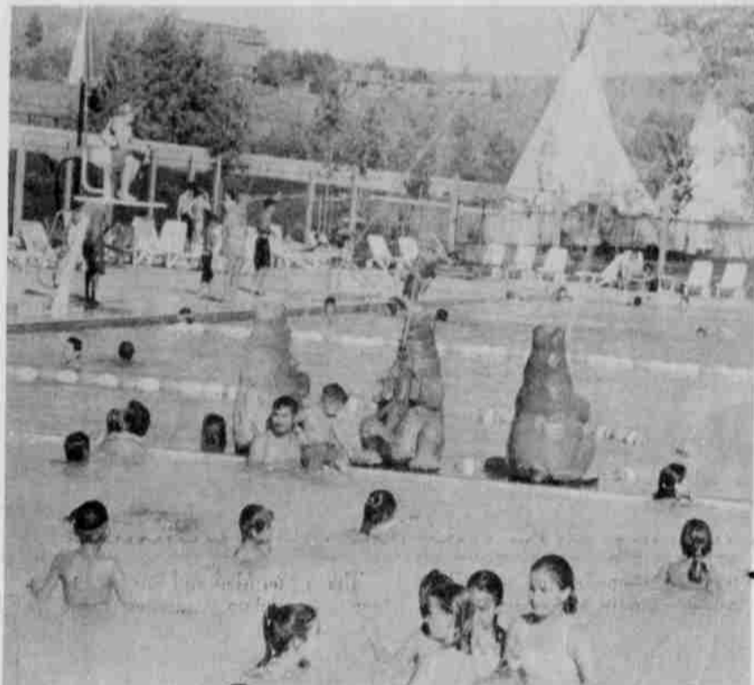
Swimmers welcomed the opening of the Kah-Nee-Ta pool.