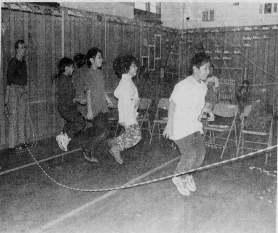
As many as four jumpers jumped at the same time.