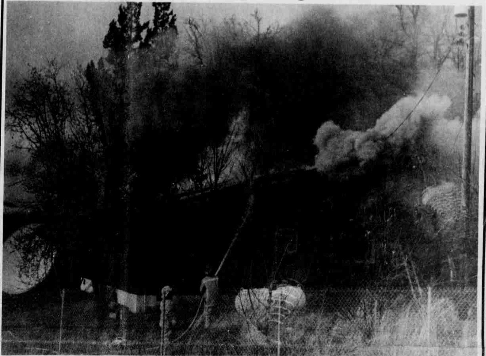
A fast-moving fire quickly engulfed the Macy house Tuesday, December 16. The house was completely destroyed.