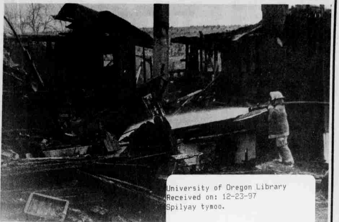
Firefighter cools off pile of smoldering debris.

University of Oregon Library Received on: 12-23-97 Spilyay tymoo.