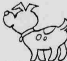
K'usi K'úsi (dog)