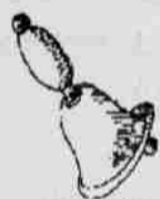
Kw'alál kw'alal (bell)

Shin iwalptaiksha (who is singing) dot to dot