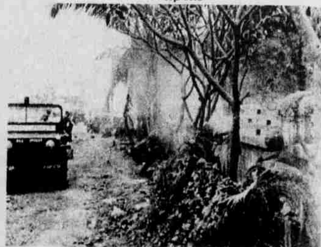
Walptaikláma Papalamtusit (Wars or Fighting Against the Enemy)

WWI, WWII, Korean Conflict, Modoc War, Vietnam, Gulf/Desert Storm, Snake and Grenada.