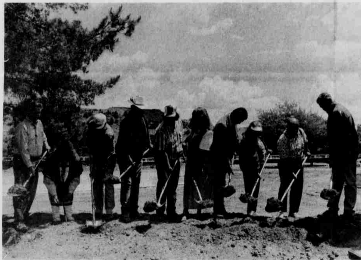
Following the Flood of 1996, Kah-Nee-Ta Village was completely razed and reconstructed.