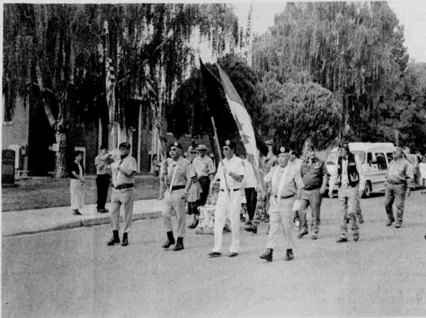
Korean Veterans were honored in July 1995.