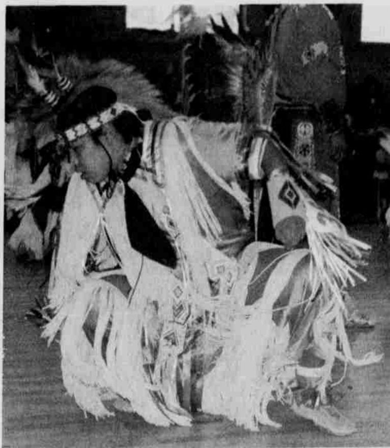
Grass dancer participates in Lincoln's Birthday Powwow.