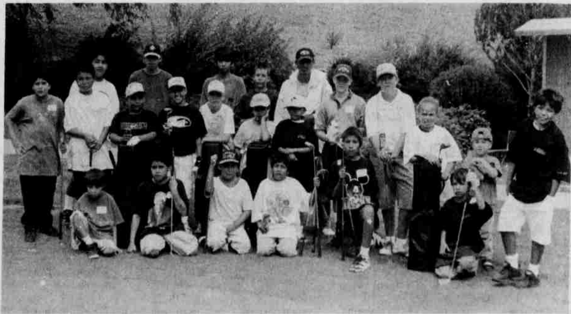
Photo of youth at the Junior Golf tournament