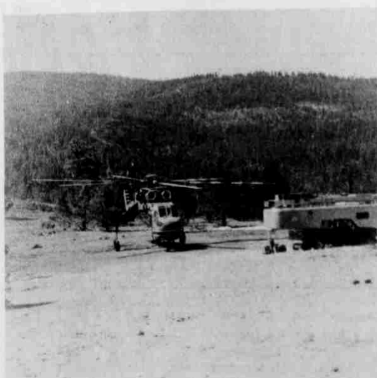
A helibase is used to refuel the helicopter near the logging areas