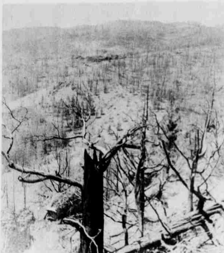
Results of the 1996 Simnasho fire