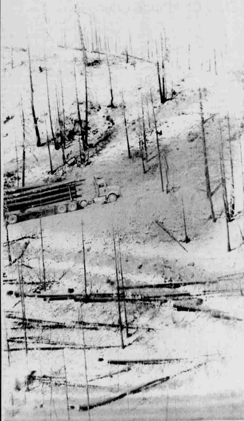
Loaded log trucks travel up steep windy roads before reaching any of the paved roads

Logging started up in the Mutton Mountains June 16 and damaged logs, resulting from the 1996 Simnasho fire, are being hauled out.