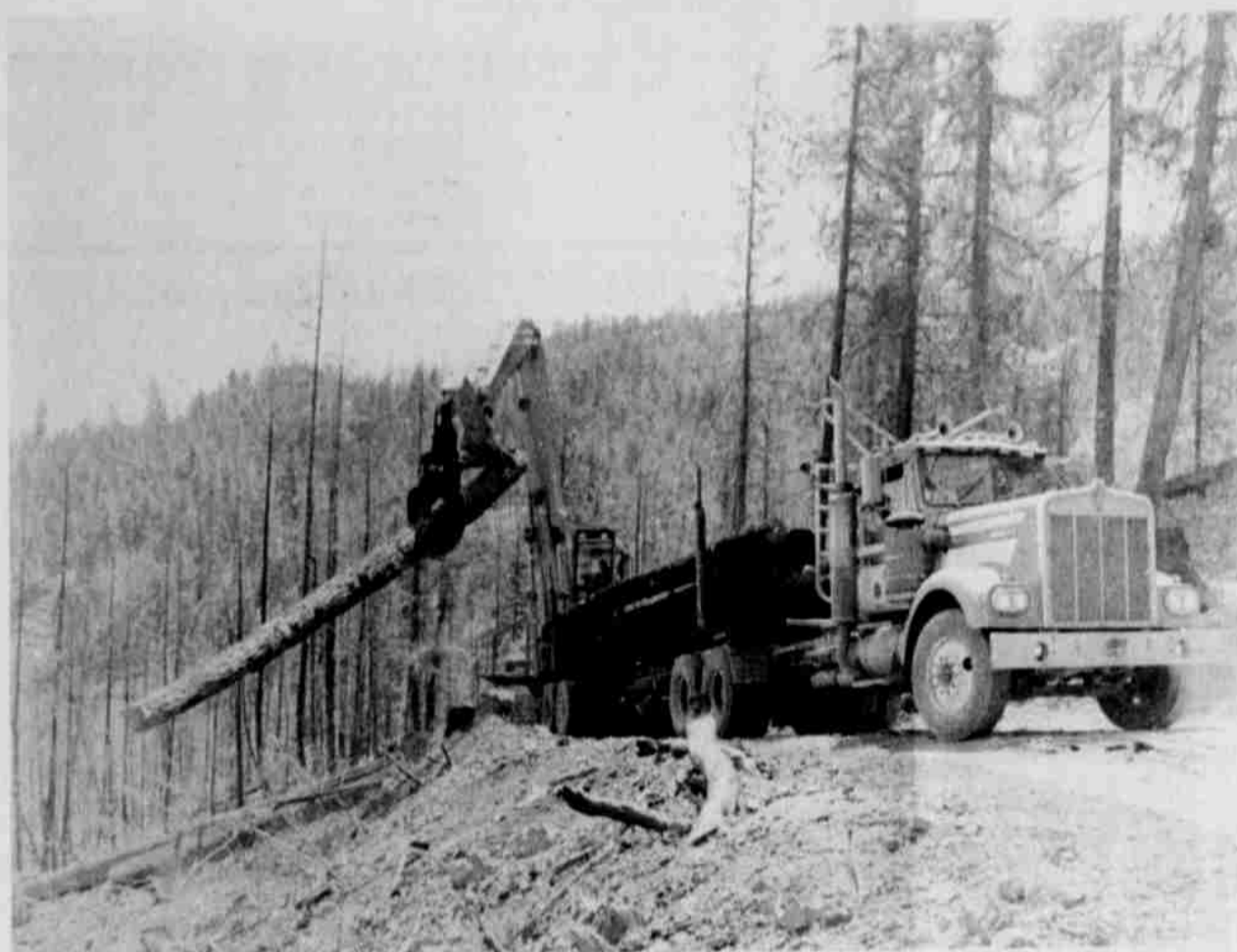
Tractor logging loads are loaded off a spur road