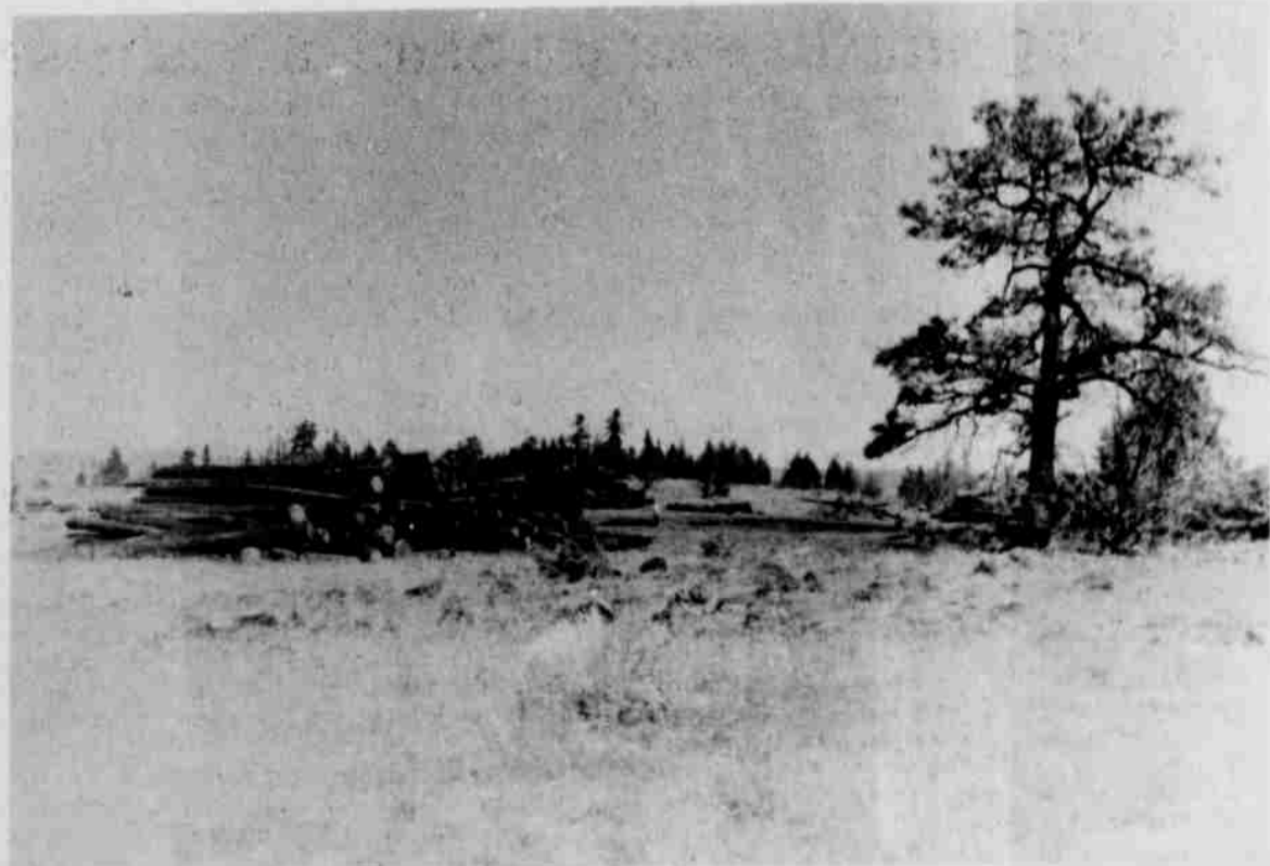
Log decks are piled near each timber sale unit