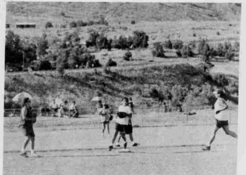
The play's at second base