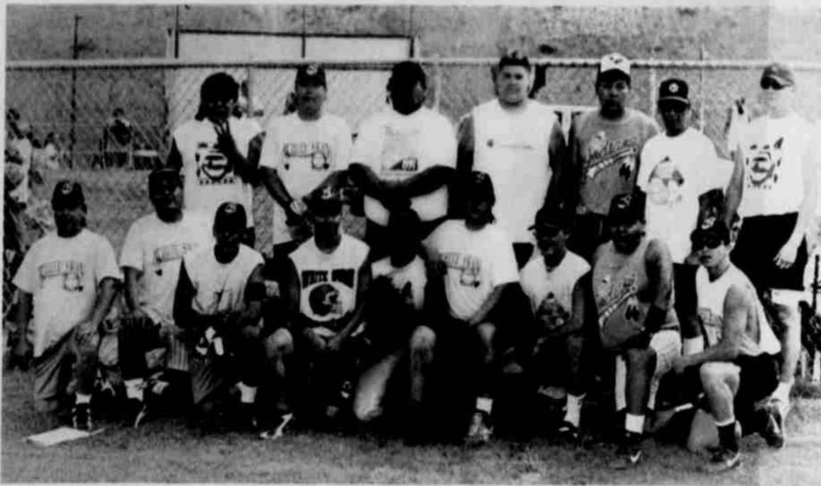
1997 men's Pi Ume Sha Champion White Swan team picture

White Swan was the Men's winner and Yakama won the Women's division of the Pi Ume Sha 1997 All Indian Men's & Women's softball tournament, held June 28-29 at the Warm Springs ball fields. There were eight teams for both divisions.