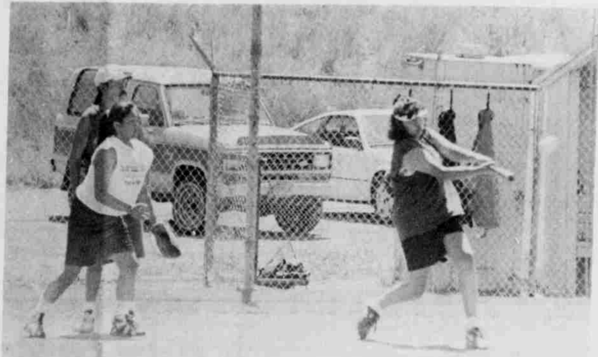
Yakama playing Fort Hall to get into the Championship