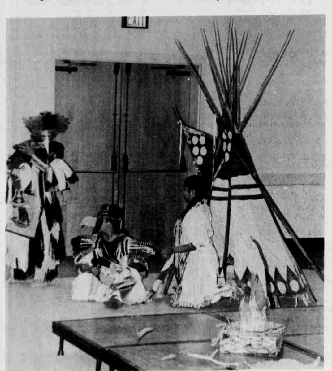
Members of the Livewire Theater group presented the "Legend of Kah-Nee-Ta" June 3 at Kah-Nee-Ta Lodge. The presentation was produced by the Community Health Education Team and Kah-Nee-Ta Resort.