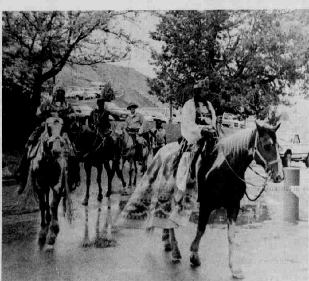
Full dress parade concludes at the Lodge, despite a heavy downpour of rain.