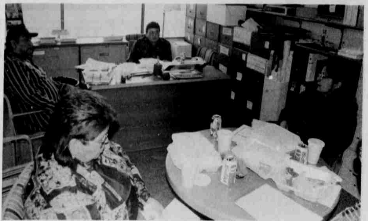
Planning team works to organize Tribal Information Day at the State Capitol.

There are no best management practices exclusive to these areas; however, all BMP's related to the various resource areas could apply in the event that management activities are allowed at some future date.