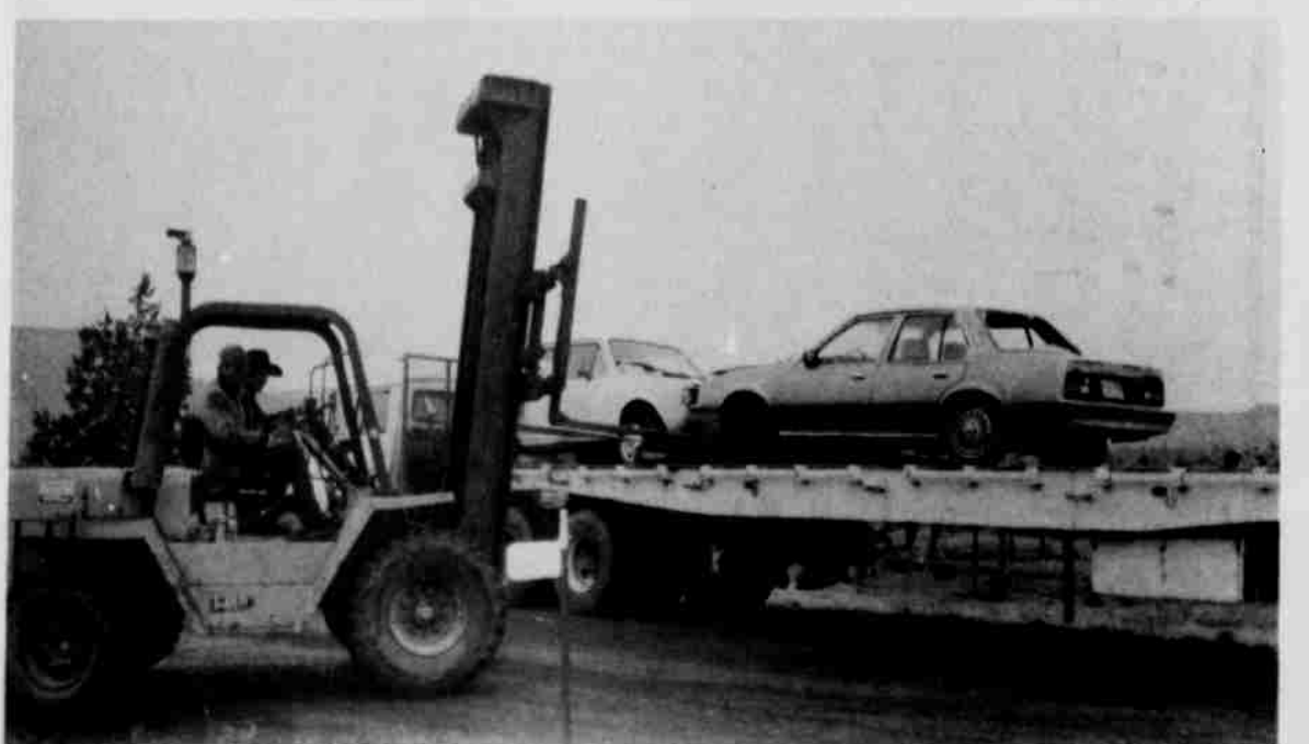
Over 100 cars were crushed at the Industrial Park as part of Warm Springs cleanup efforts.

Another good idea is to give the Police dispatcher a call at 553-1171 so that they could advise their officers and the Fire and Safety department. "Let them know where and when you will be burning and this might keep emergency vehicles from