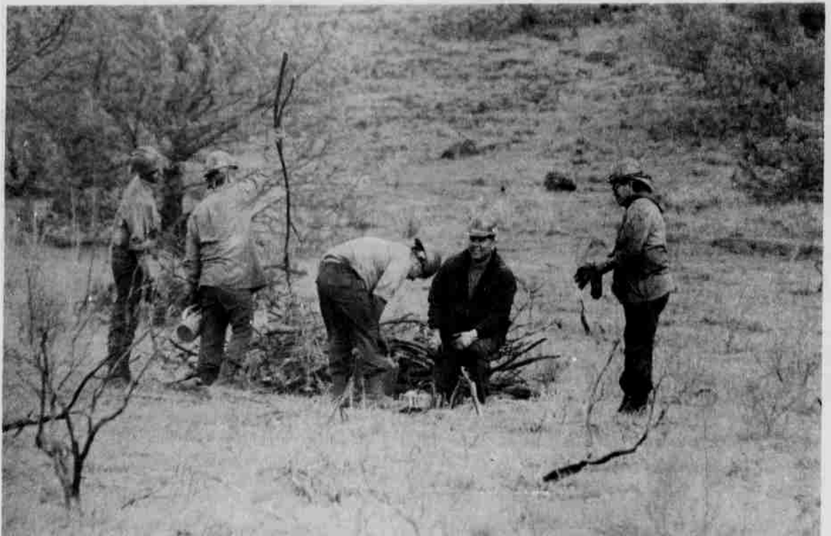
Warm Springs Hotshot crew cleans up Highway 3 toward Kah-Nee-Ta.

Society (ACS) to assist women in getting the care they need and deserve. You or your provider can call the ACS at (541) 389-4466 to see if you qualify. You may also call your local Health Department for more information 475-4456. This Mother's Day, do something for yourself-get a Women's Health Check!