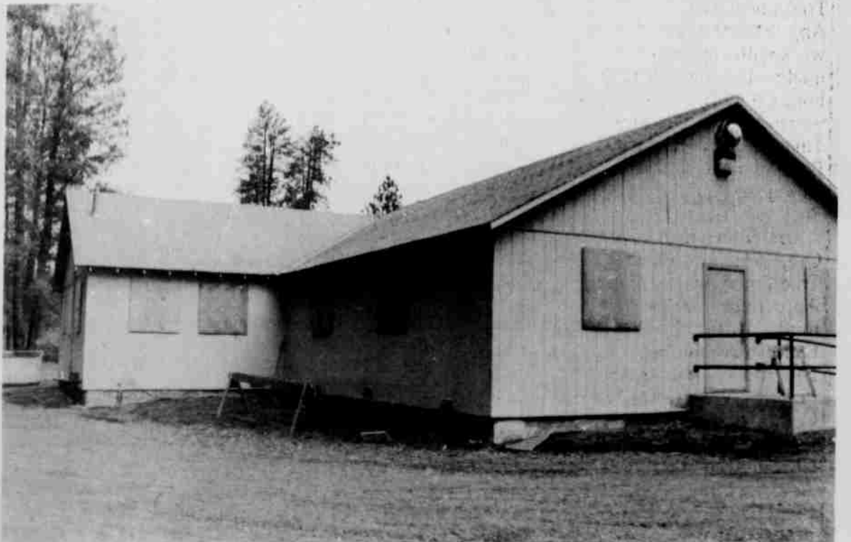
Damage to He He Longhouse was partially repaired. Windows are now boarded to protect them.

sometimes weddings and memorials are held at the Longhouse.