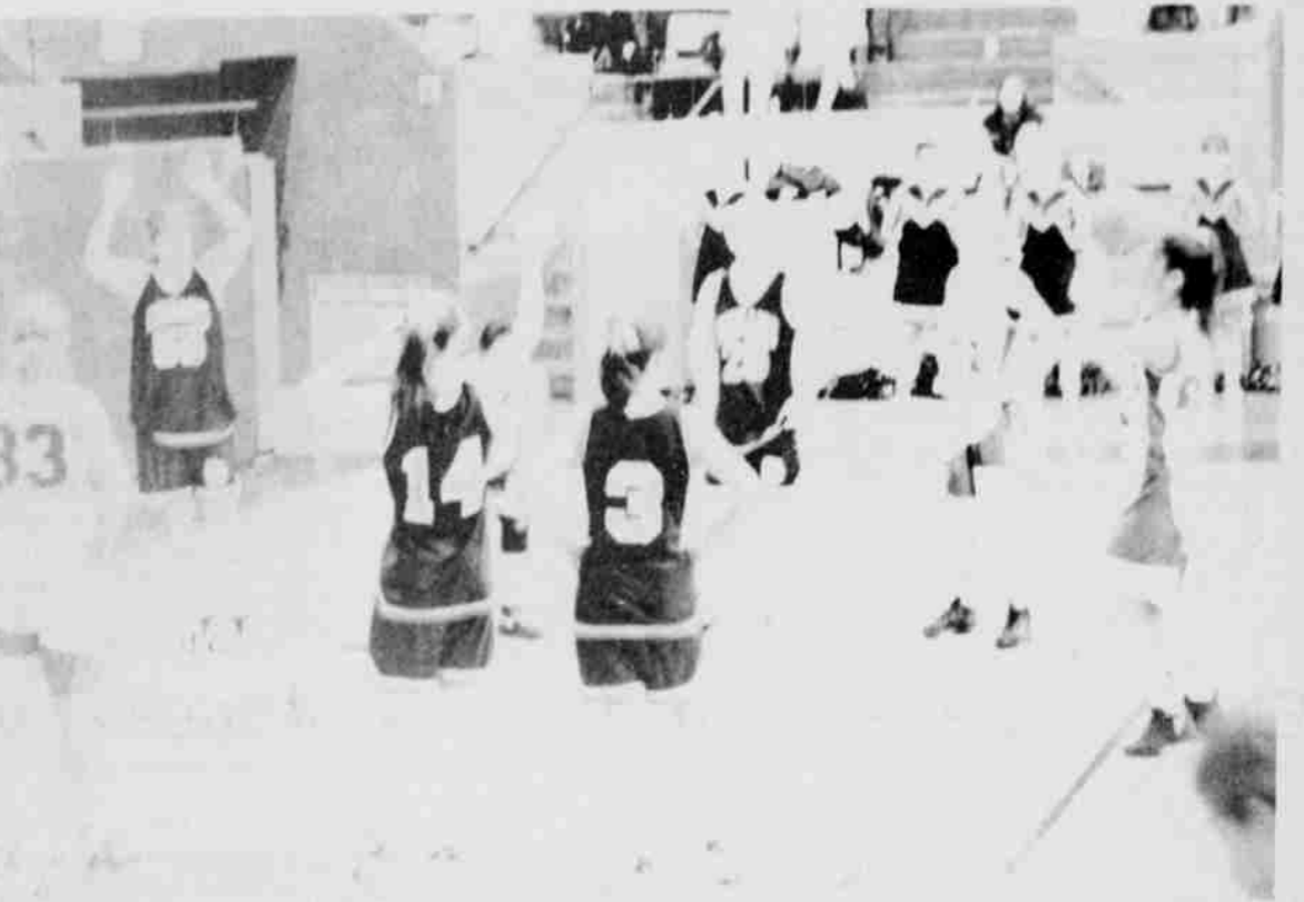
Deece Suppah shoots a free throw during the game against the Scappoose Indians, at the state tourney.