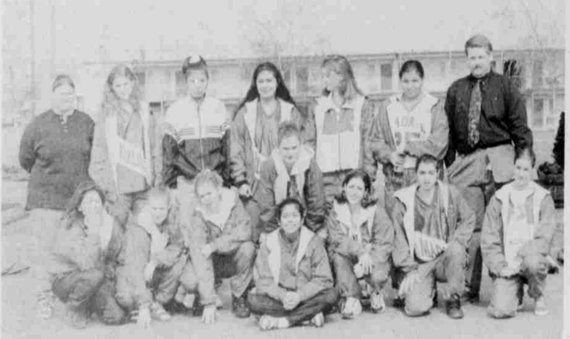
Madras Lady Buffaloes basketball team shown here heading to their game against Scappoose.

Madras received the sportsmanship award for the tourney and have hopes for next year losing only three players from this years team.