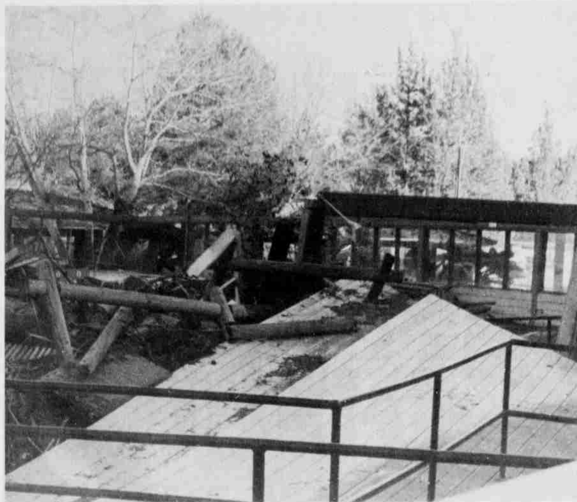
Flood of '96 took its toll on the Village.