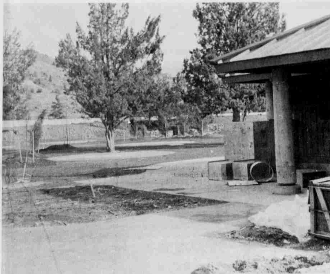
Teepee area is greatly improved and include concrete pads and laundry and shower facilities.