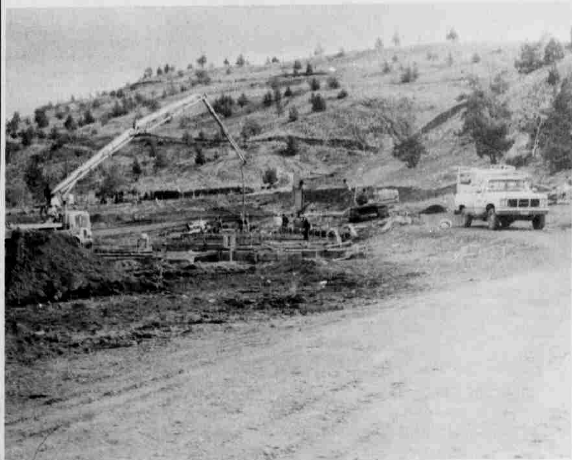
Thirty units will be available to guests sometime in July.