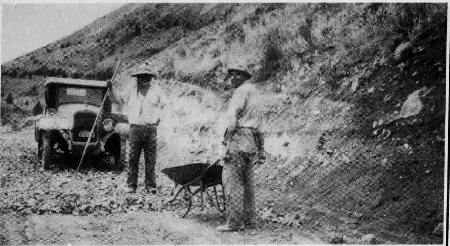
Warm Springs Reservation Indians at work on road from the Agency to Mecca, 1928.