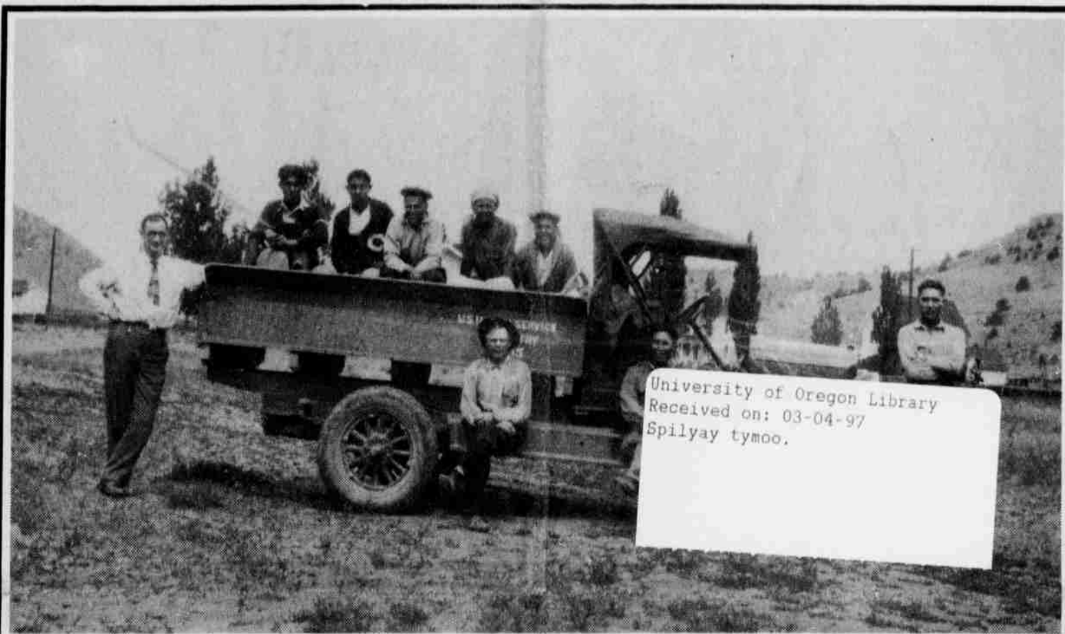
Warm Springs Reservation Forestry crew in front of garage, ready to go. Photo by Pat Gray 1928.

The Tribe is currently in its second year of a ten-year lease. The lease year runs from October 1 through September 30. The cost for this year's lease was $137,000. The cost increases two-percent annually.