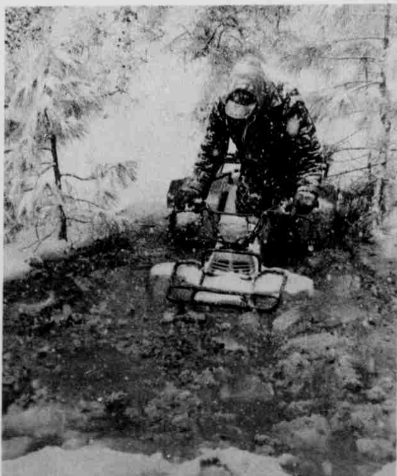
Some rescue vehicles were unable to make it to the crash site.