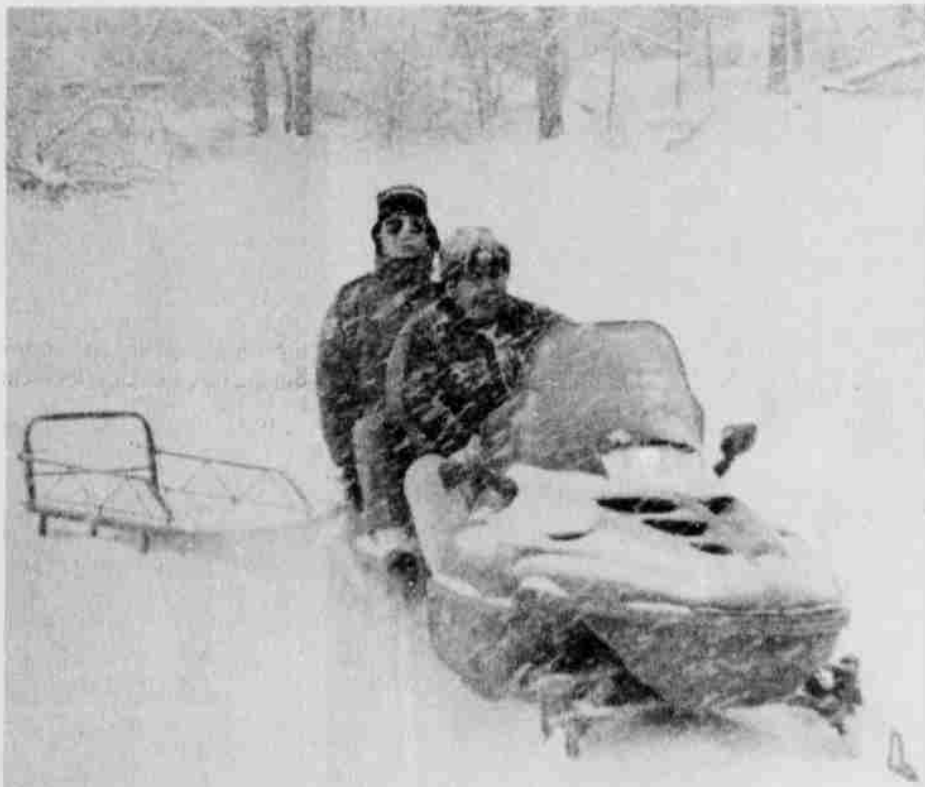
Snowmobiles pulling sleds were used during the rescue February 7.