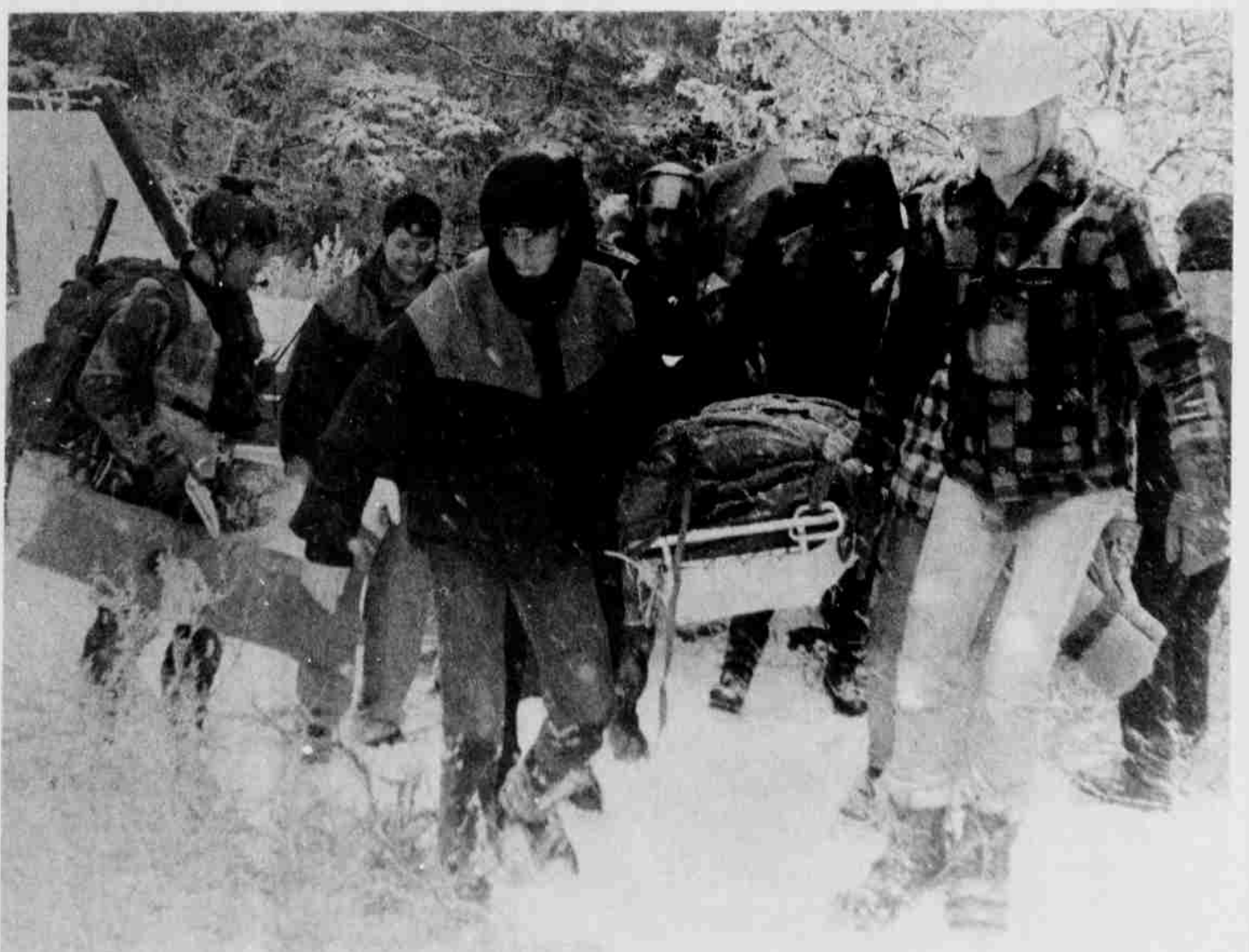
Airplane crash victims are brought out and transferred into the 304th National Guard rescue helicopter.