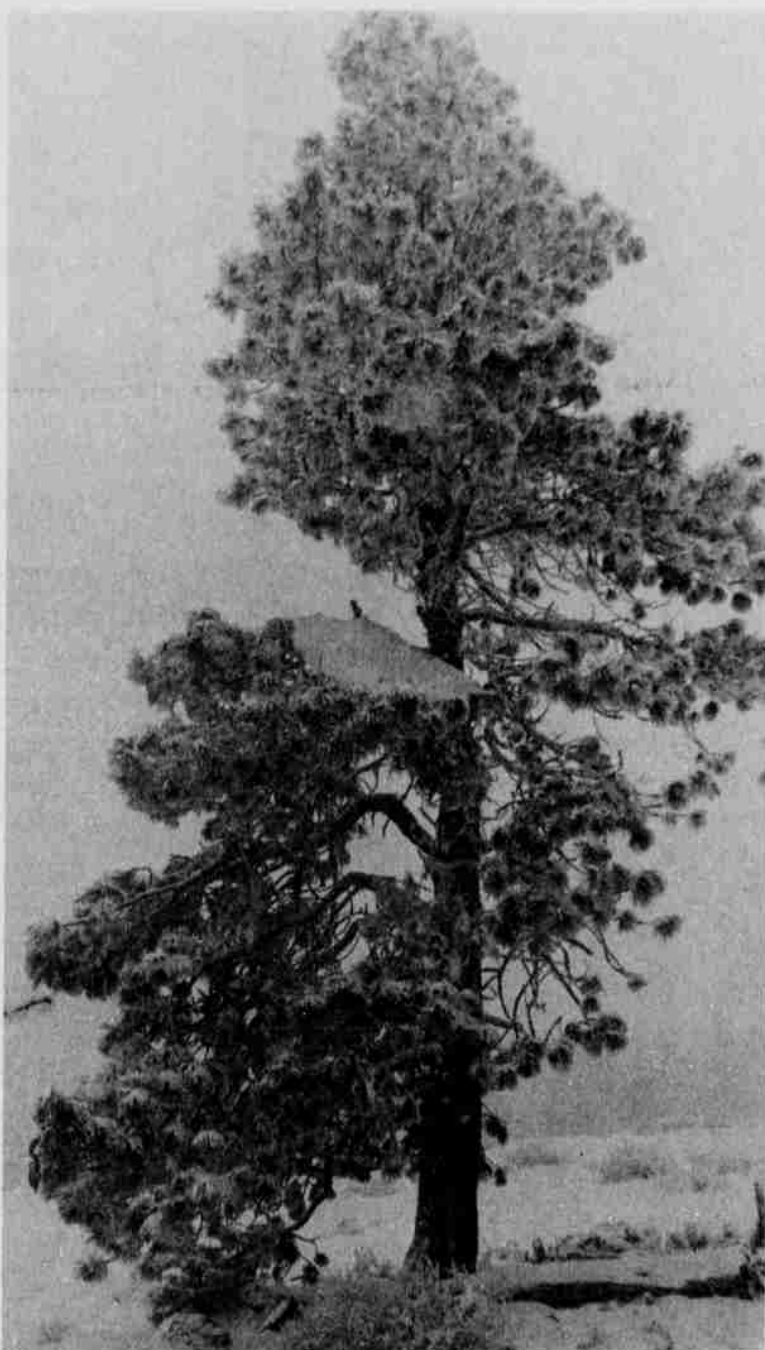
An airplane wing rests halfway up the top of the tree.